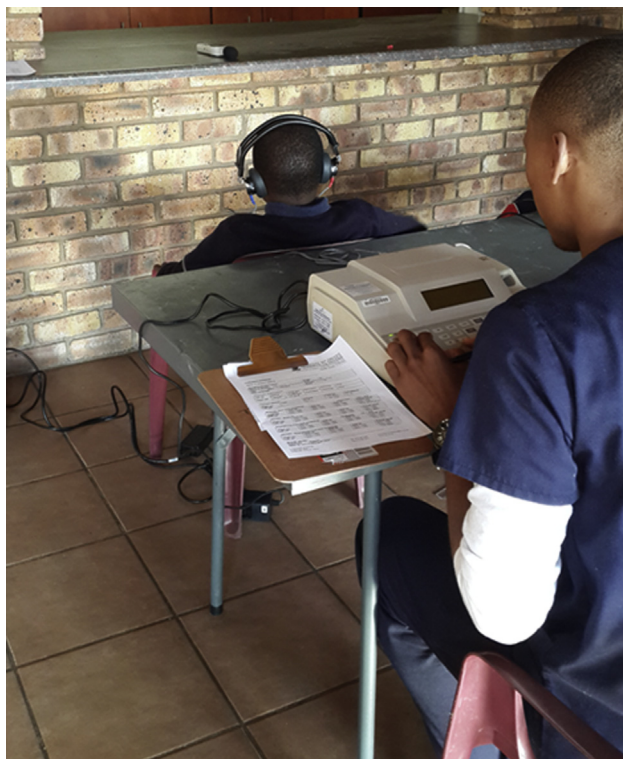
Fig. 1 – Screener administering hearing screening by sitting behind the patient.

conducted on children who referred on the rescreen. The school principal received hearing screening reports for all children tested. Based on the screening and diagnostic findings parents were provided with hearing screening reports and in the case of a referral, recommendations regarding follow-up assessments and interventions were made.