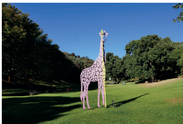
Fig. 3. Giraffe sculpture