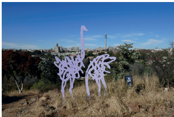
Fig. 2. Ostriches sculpture