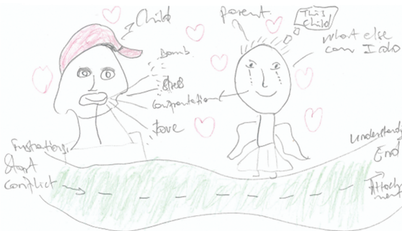
Figure 2. All behaviour has meaning

Behavior is a way that I can understand a child. That when a child behaves like this, I should ask myself what causes that, what the child wants. So, as an adult I need to sit down with a child and try to understand . . . not expect the child will just come and tell