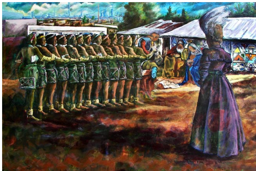
Figure 2 Solly Bele. Together as One , oil on canvas, 100 x 150 cm. 2007.

In a student work, aptly entitled Together as One (figure 2) the irreconcilable concepts of an initiation ceremony and a scene of the Nativity are represented as coexisting worlds. The representation of the ritual dancers in an everyday rural environment provides an unlikely setting for the Nativity scene and is at odds with traditional dignified and sacred representations of this theme in Christian art. By placing the Nativity in a context that de-familiarizes traditional conceptions of this theme, it is instilled with a duality. As a matrix for creative concealment and revelation of meaning implied by the coexisting worlds of the initiation ceremony and the Nativity, this representation alludes to something different from its manifest meaning. In this respect it serves as an adumbration to something that oversteps what it refers to. The deceptive representation of the Nativity scene and the initiation ceremony as irreconcilable concepts neither presupposes an appeal that the fictional situation of the dancers participating in the Nativity event should become true, nor is it expressing the wish that it should be regarded as true. It rather serves as an invitation to consider a fictional point of view where the 'lie' of the irreconcilable worlds of the Nativity and the initiation ceremony may be consummated 'as if' it is true.