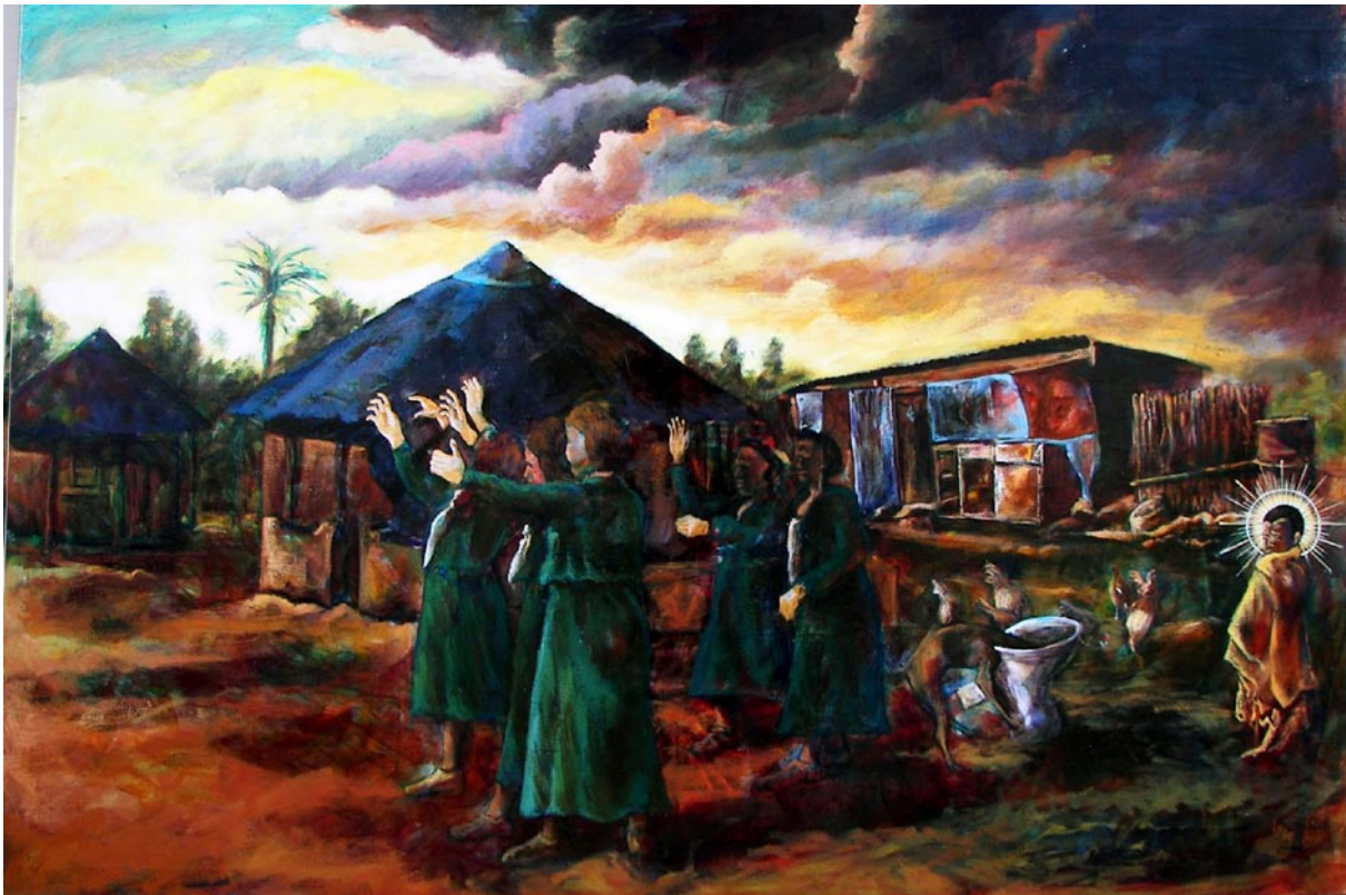
Figure 3 Solly Bele. Isolation , oil on canvas, 100 x 150 cm. 2007.

In order to respond creatively towards the fictional truths suggested in this work, viewers have to free themselves from their everyday religious experiences. Their responsiveness to discern the existence of a range of possible meanings in the work and to recognise negations of their expectations regarding religious practices as a challenge to disclose other and unforeseen fictional truths are pivotal aspects in their creative interpretation of this work. In order to disclose these fictional truths, viewers have to hypothesise: that is, they need to make an informed guess about the artist's possible playful interests with this somewhat unconventional depiction of a religious theme. By reaching to and fro between provisionally accepted fictional truths, it is likely that creative viewers will discover something about the fallibility of their own religious preconceptions, which will in turn serve as an impetus to re-evaluate the validity of their initial interpretations.