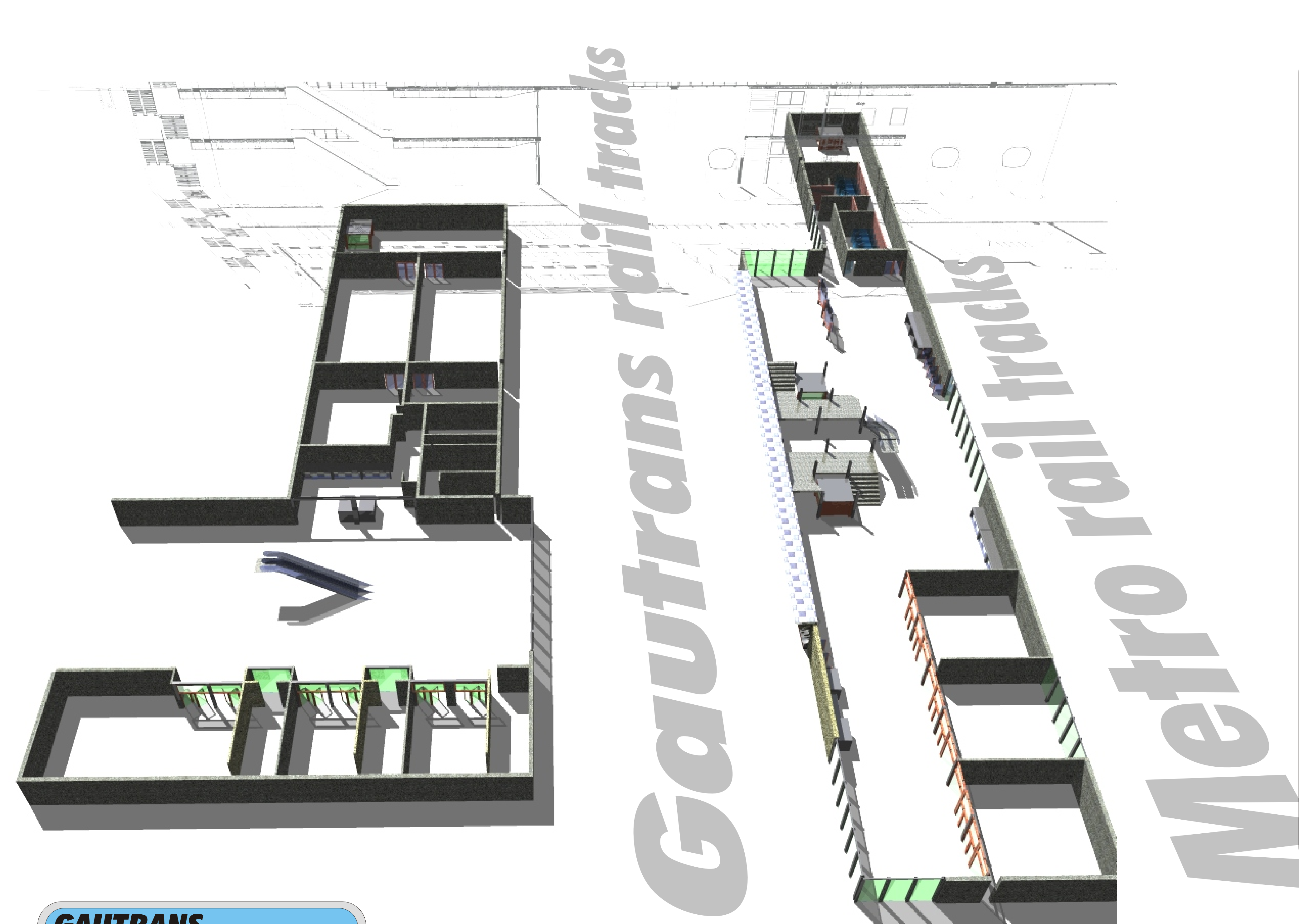
FIRST FLOOR UNDER GROUND