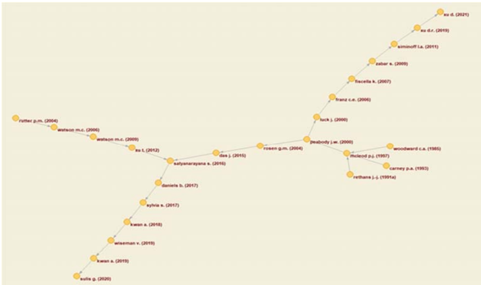
Supplement 2: Main path