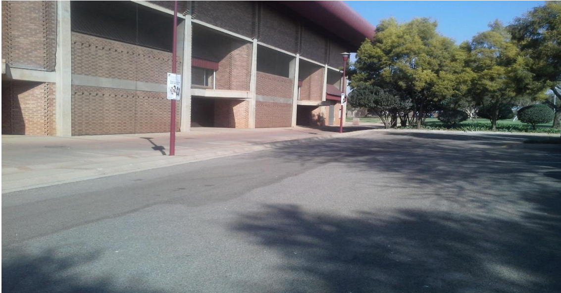
University of Pretoria Mamelodi Campus