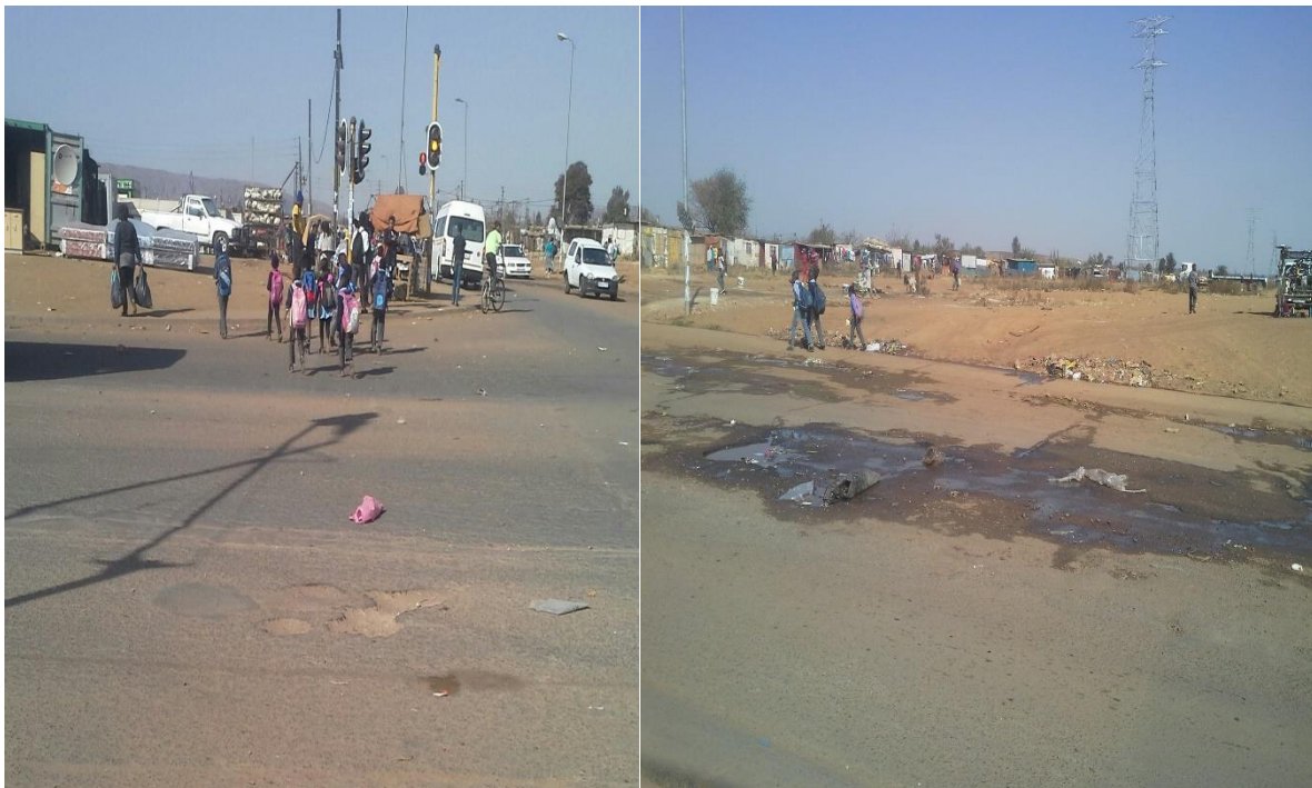
Participants' living environment