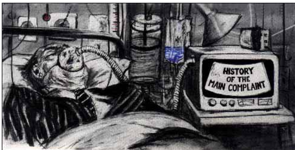
Figure 2 William Kentridge. Title drawing for the film, History of the Main Complaint (1996, charcoal and pastel on paper, 70 x 120 cm, private collection).

The word “history” in the title of the film indicates to the viewer that the film is about remembering a faded past – bringing into view the passage of time by rendering it visible through the spectral traces wrought by the erasures as the film unfolds. Note outlines of bed visible through “doctors” surrounding the bed – the figures are spectral too.