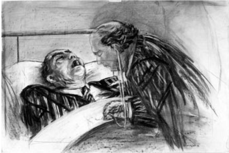
Figure 3 William Kentridge. Second Opinion . Drawing for the film, History of the Main Complaint (1996, charcoal on paper, 80 x 120.7 cm, private collection).

A stethoscope is a diagnostic medical instrument consisting of a hollow disk that is connected by earpieces (one for each ear) to two tubes. This instrument is used to listen to sounds from within the patient's body. As the doctor moves the disk to various parts of Soho's comatose body he not only auscultates in the somatic sense but becomes aware of personal qualities of the patient as the monitor next to his bed picks up what is heard through the stethoscope and projects it as visual images seen by both the viewer and the doctor. The doctor's probing stethoscope delves deep into Soho's unconscious searching for guilt-ridden memories.