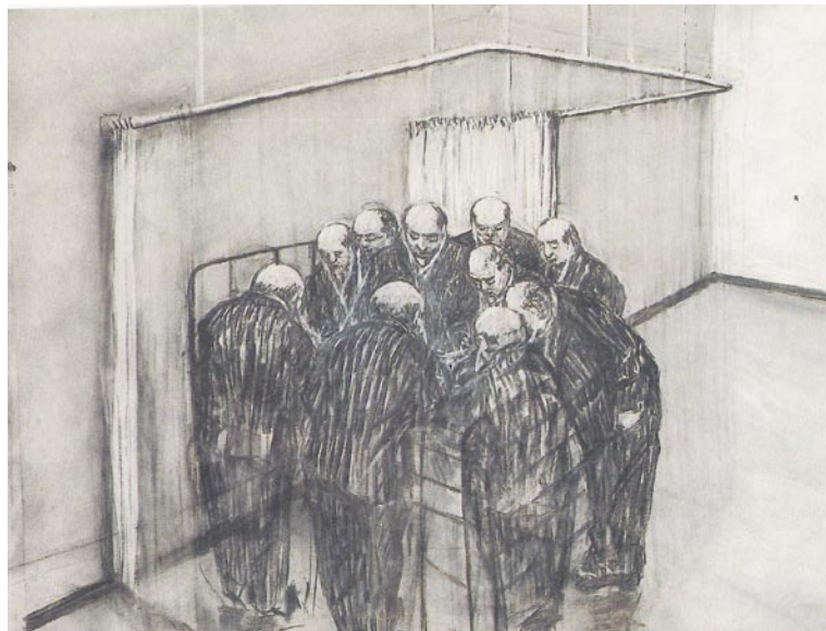
Figure 4 William Kentridge. Consultation, 10 Doctors . Drawing for the film, History of the Main Complaint (1996, charcoal and pastel on paper, 120 x 160 cm, private collection).

A second doctor arrives and now X-rays appear of his chest and lungs. X-rays are used to see bone fractures and other abnormalities. The X-ray image looks like his earlier eraser marks and smudges on paper. An X-ray drawing cuts through Soho's body and moves down his spine almost like the cafetière plunger in Mine . The X-ray assumes the characteristics of a living organism as it starts to breathe. The monitor screen constantly changes to show new images either from Soho's past or of his internal organs.