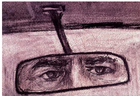
Figure 5 William Kentridge. Drawing for the film, History of the Main Complaint (1996, charcoal and pastel on paper, 120 x 160 cm, private collection).

The scenes switch rapidly between the doctors' search for information with the aid of high-tech equipment and Soho's dream as he is driving along a deserted road looking through the windscreen. Soho's heart is beating violently on the heart machine. The car hits something and a plate breaks. The action intensifies as the telephone rings once more. An X-ray of his abdomen flashes on the screen, then an ink damper becomes visible. A typewriter rattling frenetically speeds the action even further and various body parts flash on the screen.