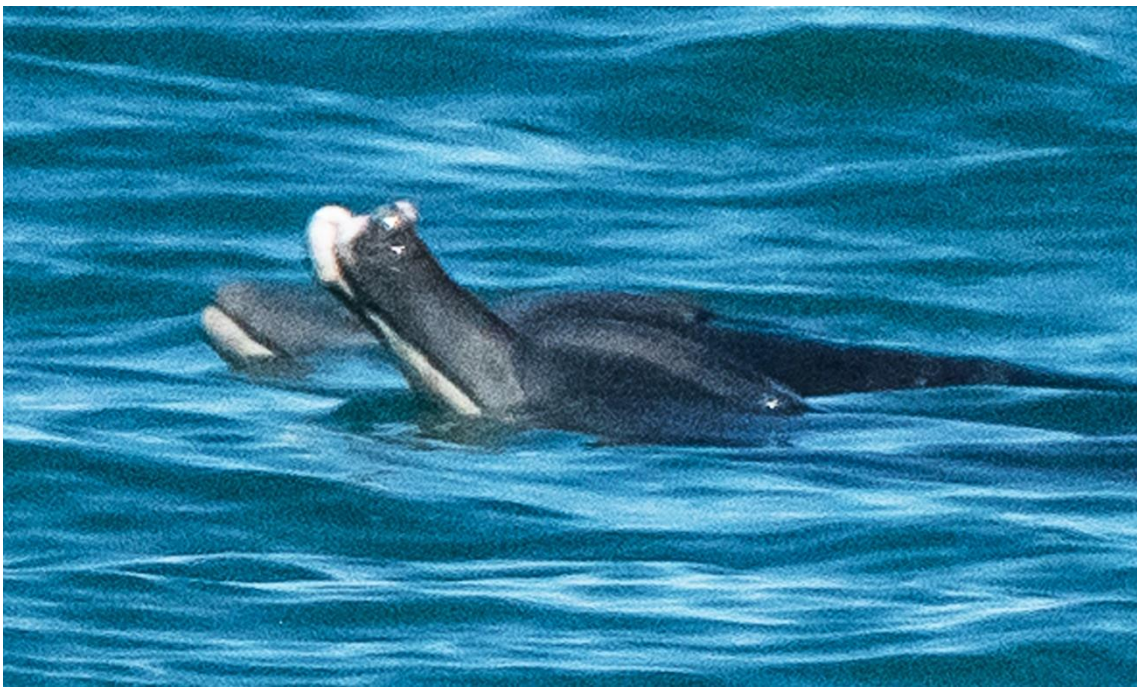
Supplementary File S6. No ID, St. Sebastian Bay, 2021.