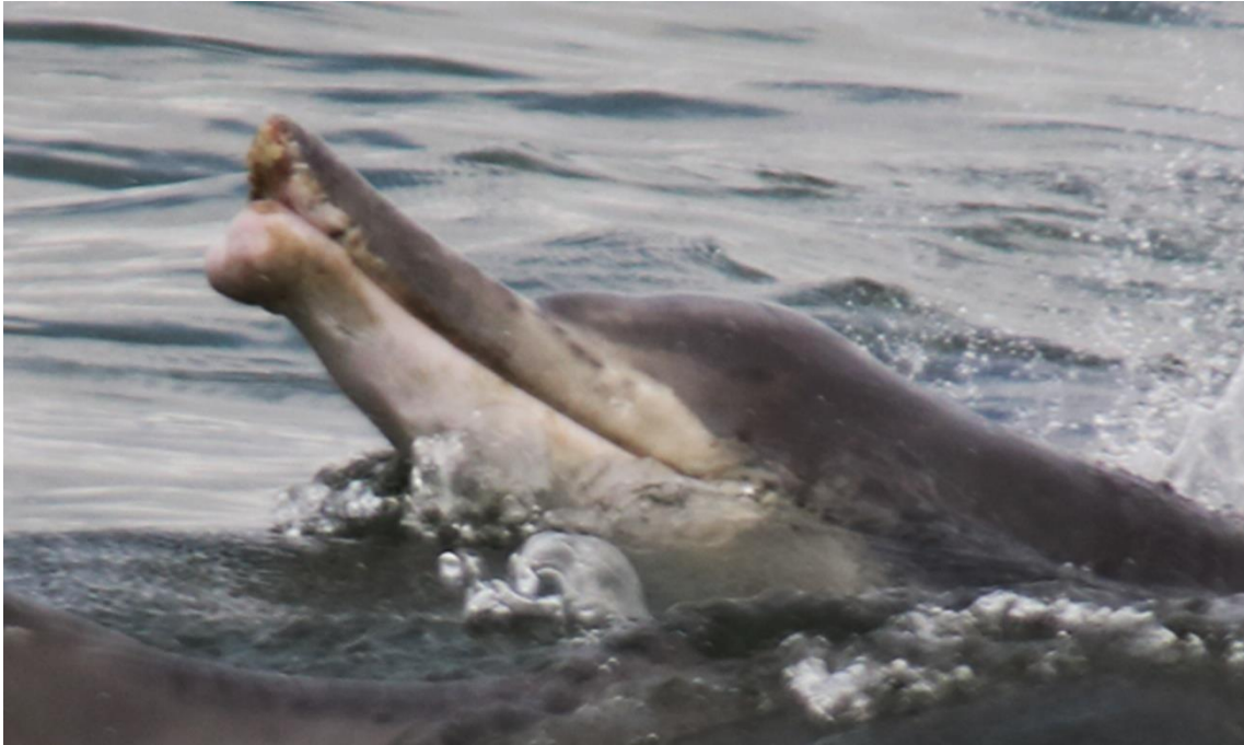
Supplementary File S17. No ID, Plettenberg Bay, 2019.