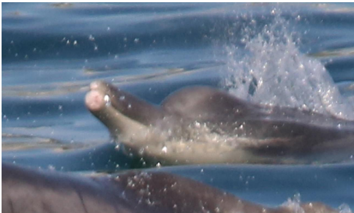
Supplementary File S16. No ID, Plettenberg Bay, 2019.