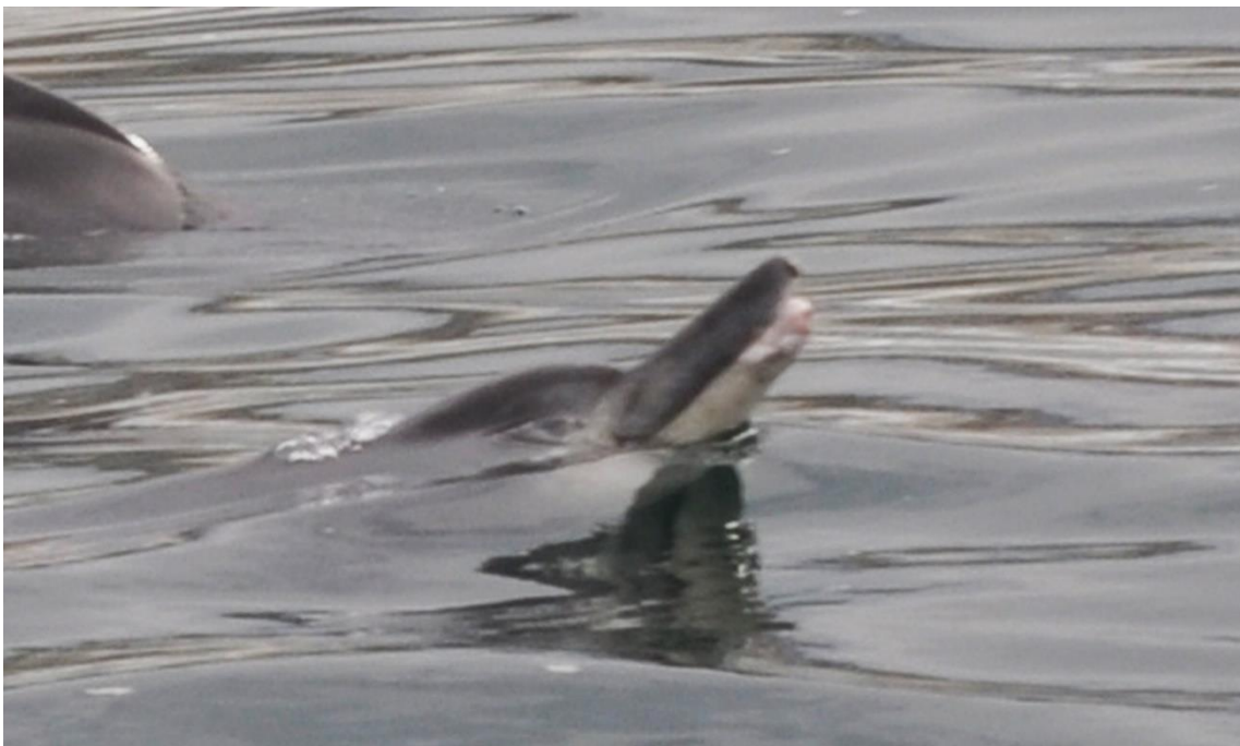
Supplementary File S8. SA070, Mossel Bay, 2011.