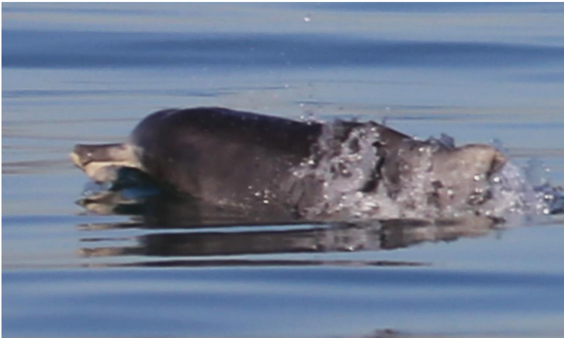
Supplementary File S1. SA007, False Bay, 2016.

Appendix 1. Photographs of the abnormal rostrum conditions characterized in this study - and not available in the main manuscript - with relative ID number (if available), locality, time and credits.