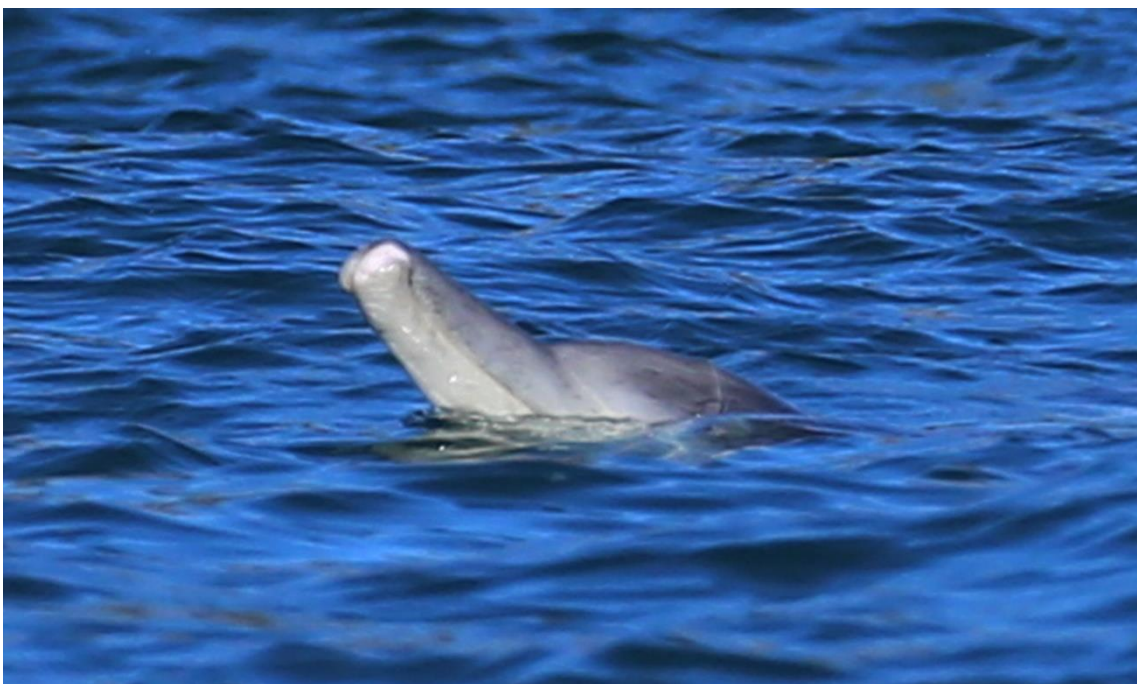
Supplementary File S2. SA041, St. Sebastian Bay, 2016.