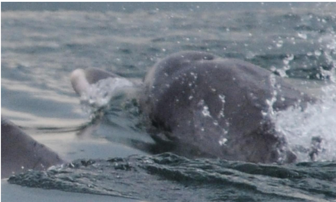
Supplementary File S12. No ID, Plettenberg Bay, 2014.