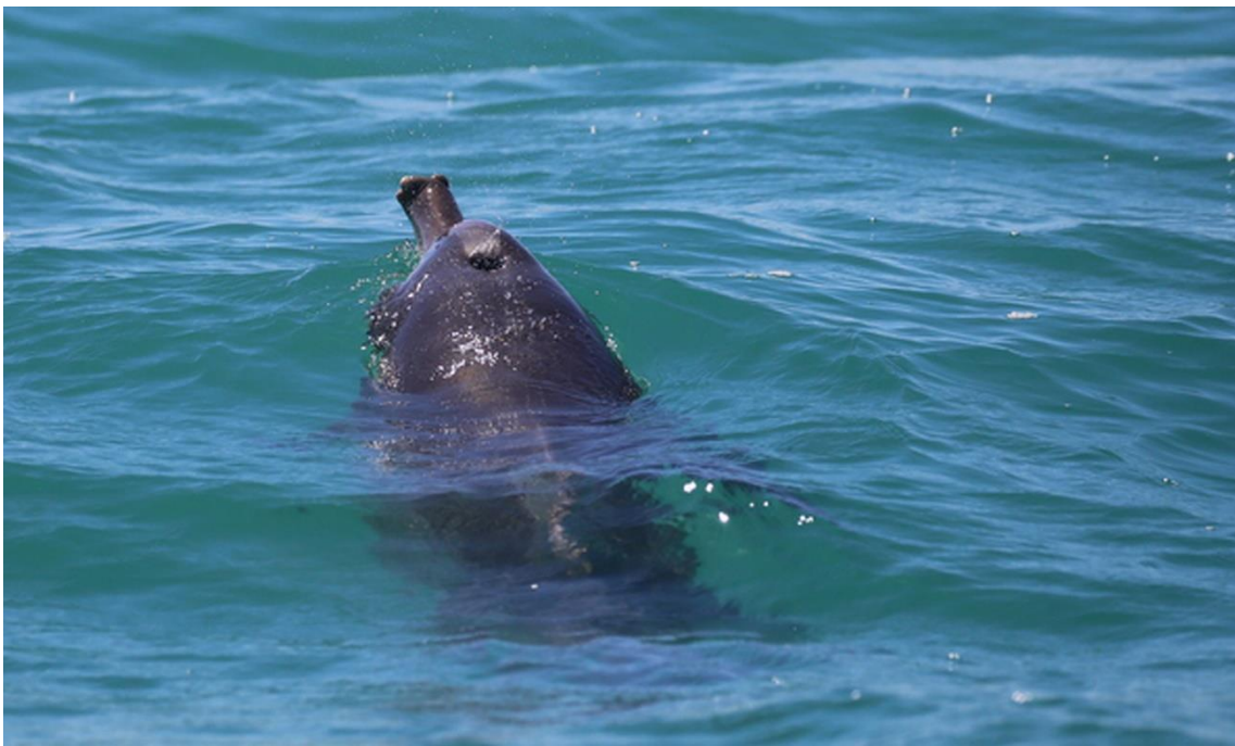
Supplementary File S4. SA052, Struis Bay, 2016.