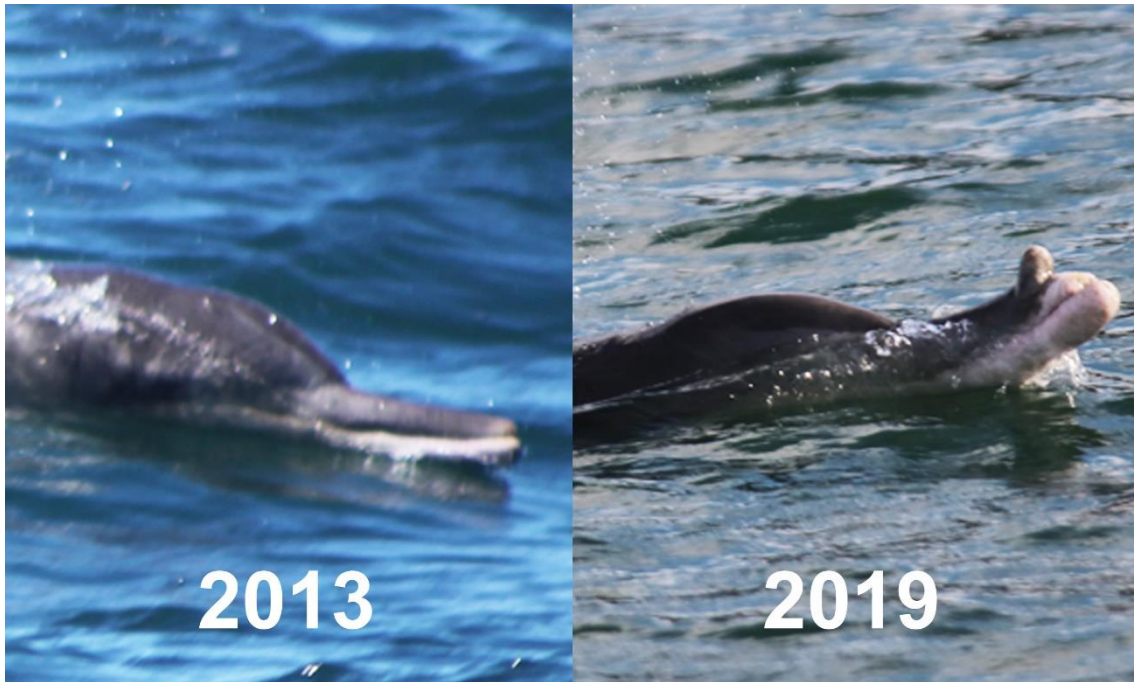
Supplementary File S15. SA083, Mossel Bay (2013) and Plettenberg Bay (2019).