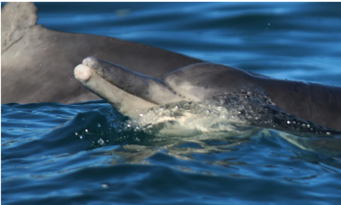
Supplementary File S14. No ID, Plettenberg Bay, 2018.