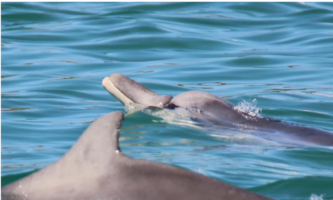
Supplementary File S18. No ID, Plettenberg Bay, 2019.