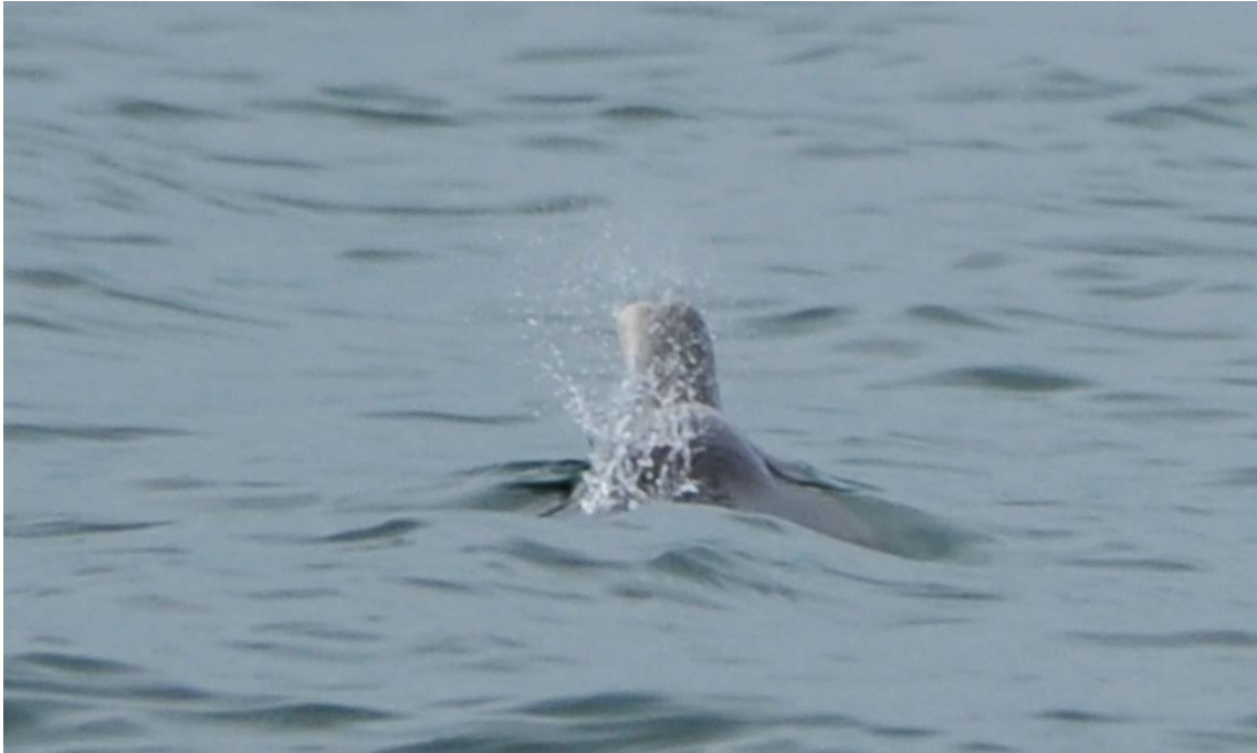
Supplementary File S13. No ID, Plettenberg Bay, 2014.