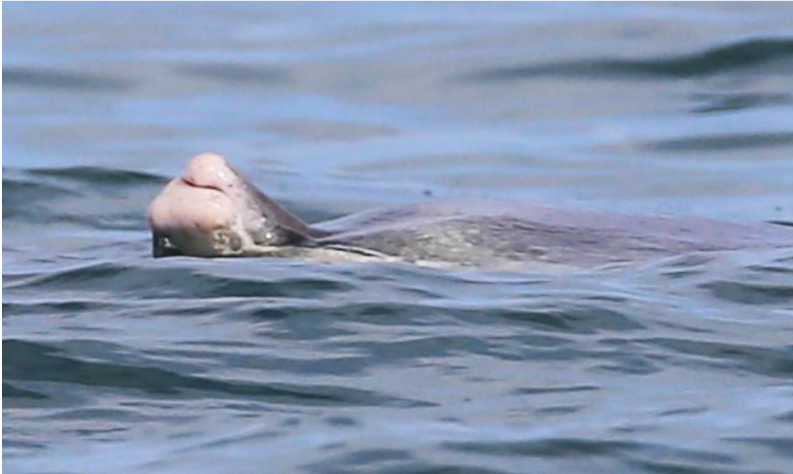
Supplementary File S3. SA046, St. Sebastian Bay, 2016.