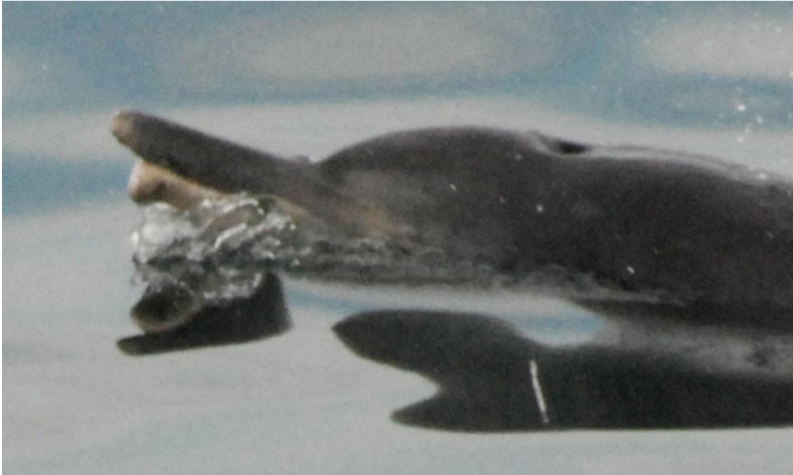
Supplementary File S7. SA063, Mossel Bay, 2011.