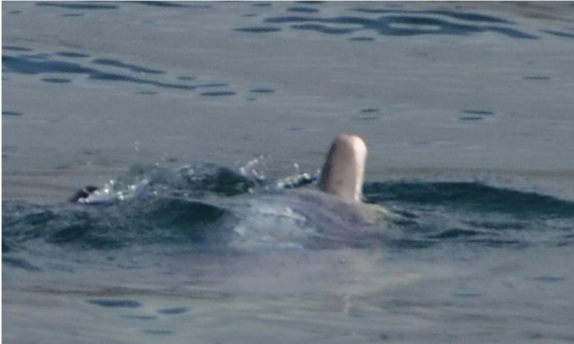
Supplementary File S11. No ID, Plettenberg Bay, 2015.