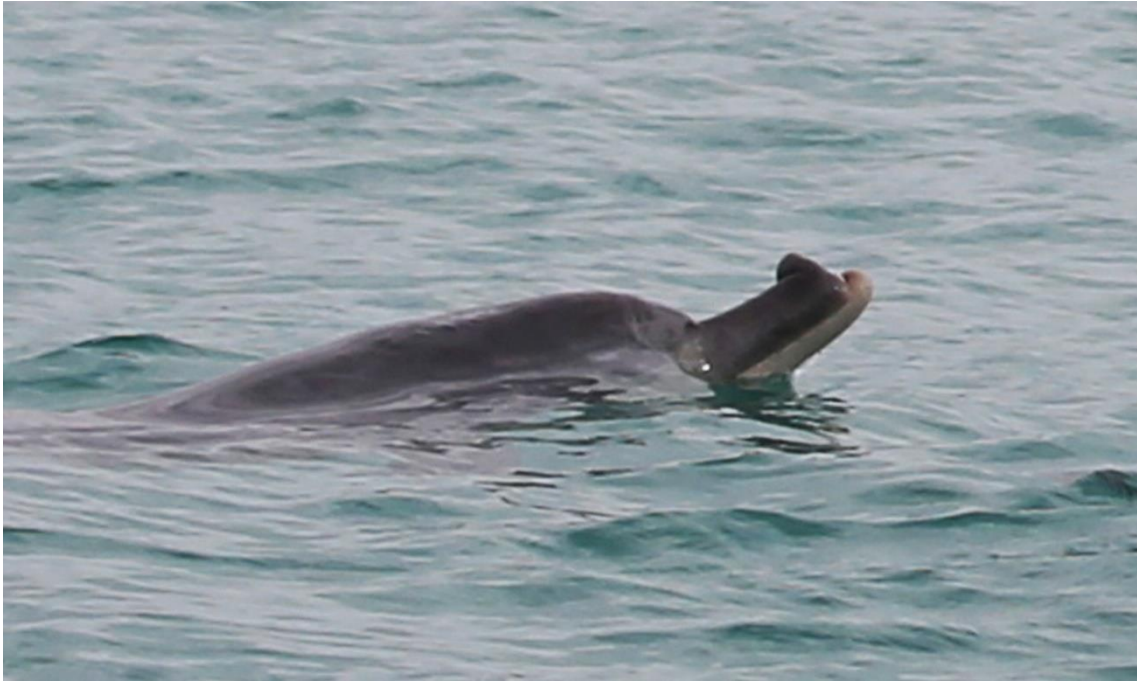
Supplementary File S5. ID04, Struis Bay, 2017.