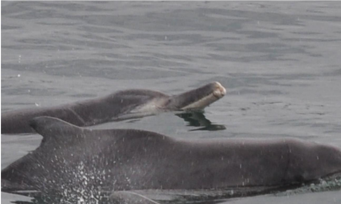
Supplementary File S9. SA074, Mossel Bay, 2011.