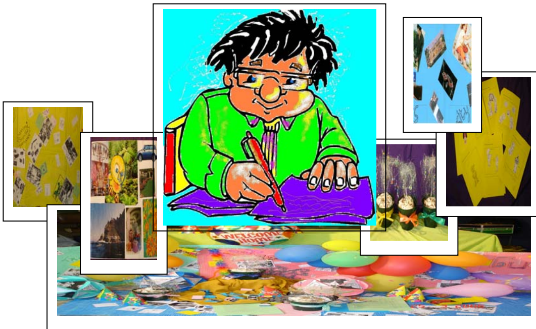
Figure 6.1: The teacher-researcher reflecting at his desk

entire adult life with the question: How can I use the arts to allow people a glimpse into themselves? This was the opportunity of a lifetime! I took my first step in the right direction – at last! (I realise that the phrase “right direction” is a laden with subjective meaning and I do not expect the reader to agree with me. The narrative arts approach satisfied aspects of my personal vision.) I hope that the reader and the people who were involved in my study are able to marvel at their own uniqueness and that they can add something special to their self-concept domains – the realms where only the self can dwell.