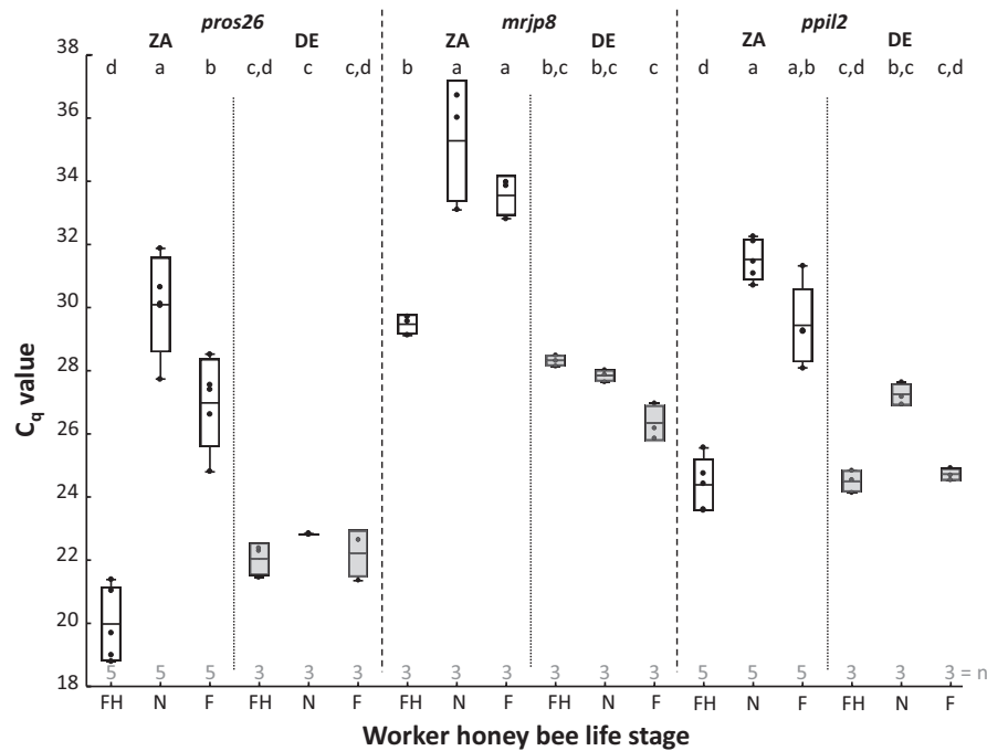
FIGURE 2 C_q values of validated genes according to worker honey bee life stage (FH, freshly hatched; N, nurse bee; F, forager bee). Boxes show mean \pm standard deviation and whiskers show min-max. Individual data points are shown as circles. White boxes, ZA = A. mellifera scutellata sampled in South Africa; grey boxes, DE = A. mellifera sampled in Germany. Sample size ( n ) refers to pools of HPGs of 3 workers each. (a–d) C_q values of the same gene with different lowercase letters are significantly different (one-way ANOVA with post-hoc Bonferroni tests p < .05 ). C_q values for mrjp8 are in ZA nurses and foragers so high ( >32 ), that mrjp8 would have been excluded as reference gene just for this reason alone.

expressed in A. mellifera -DE. This clearly points to another problem: The strong concentration of research on domesticated Western honey bees in the Northern hemisphere.