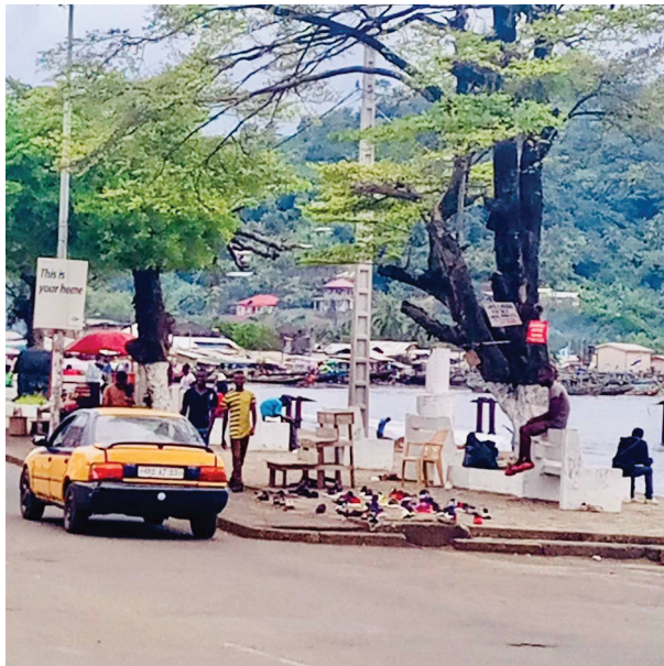
Figure 5. Relics of the first roadside trees planted in the city located at Down Beach quarter.