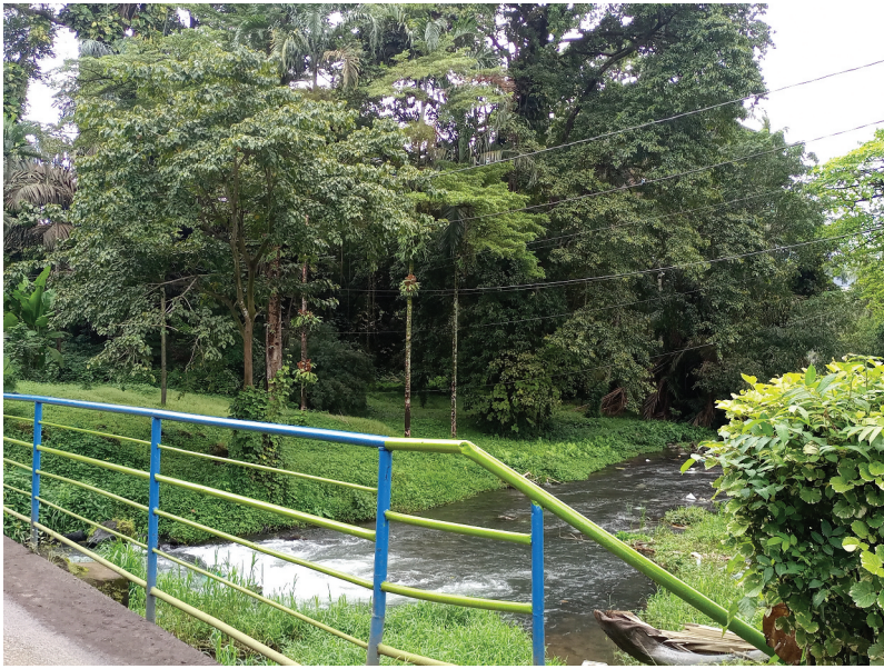
Figure 2. Limbe botanic garden bridge.