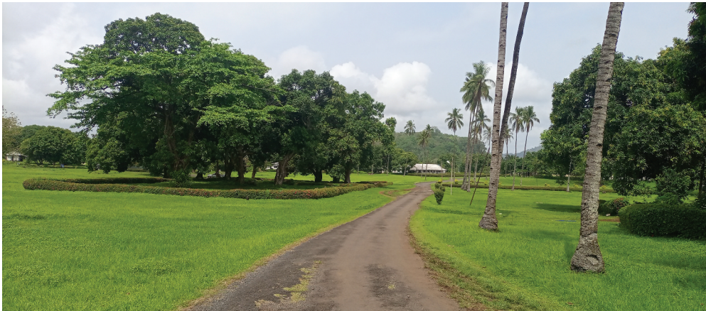
Figure 3. The institutional urban forest of the CDC behind the CDC head office.