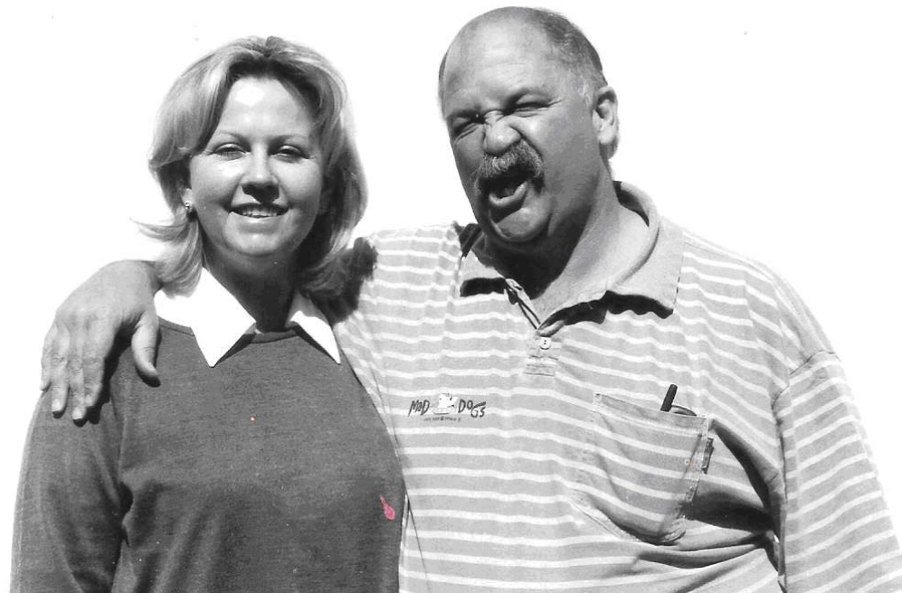
FOR MY PARENTS ...