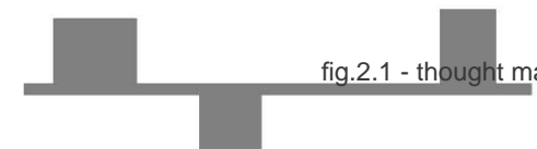
fig.2.1 - thought map