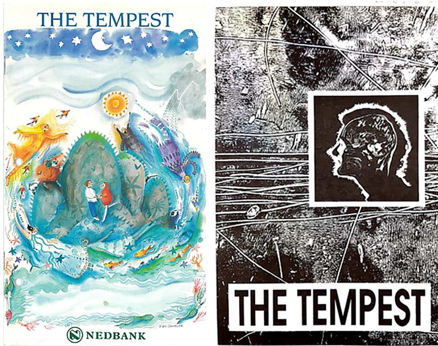
Figure 1. Programme covers for The Tempest at Maynardville (left), and The Tempest at Rhodes University (right) in 1994. 11