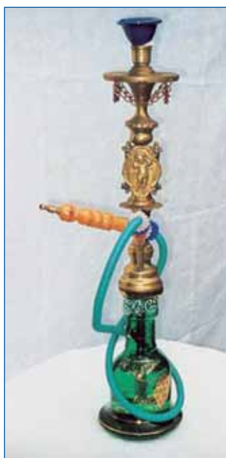
Figure 1: Water pipe (hubbly bubbly)