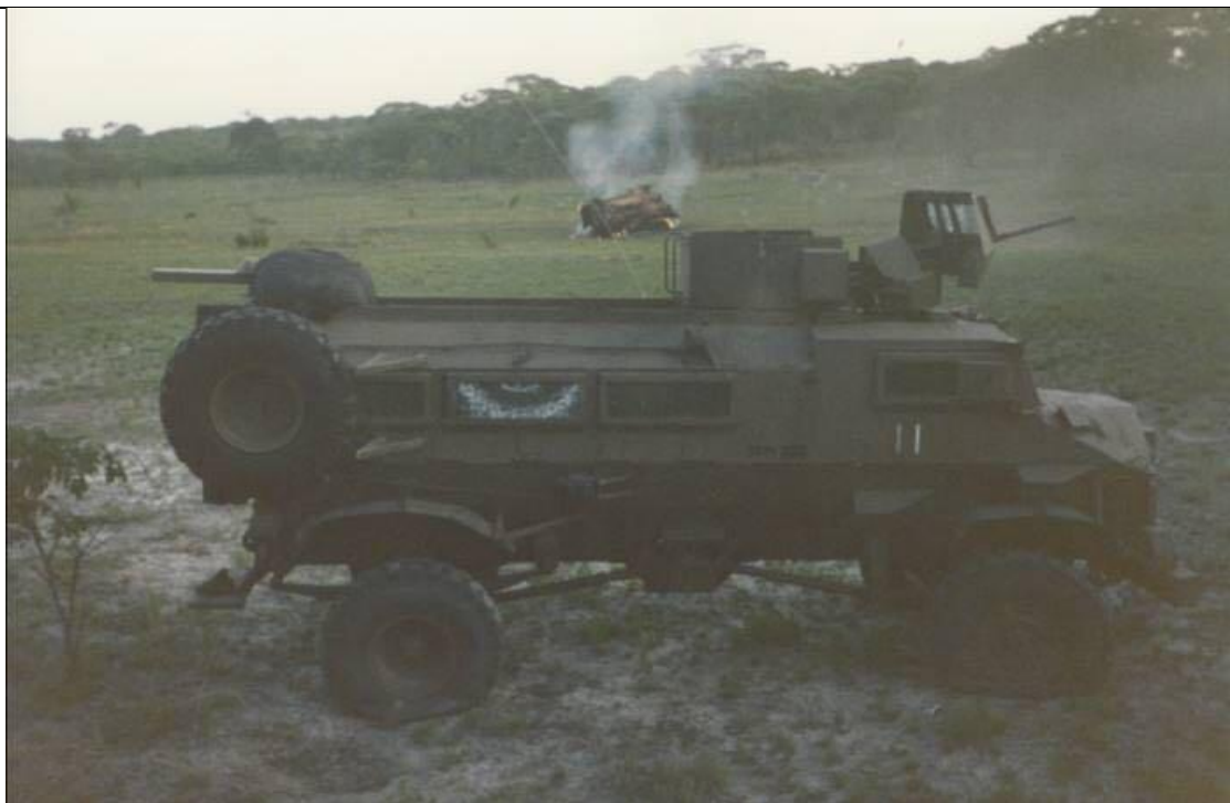
Fig. 5: The destroyed Casspirs of Second Lieutenant Anton Botes, at the back, and Lieutenant Pierre Blignaut, in the front, at the battle at Indungo on 31 October 1987.