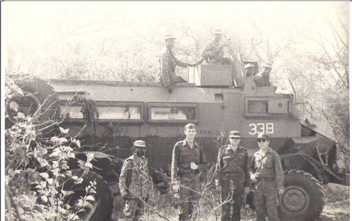
Fig. 6: The SADF Casspir Call Sign 33B, which had been captured at the battle at Indungo on 31 October 1987, displayed by Cuban soldiers.