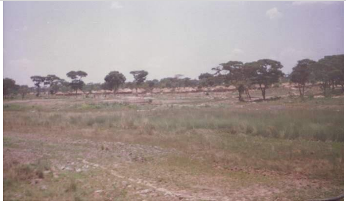
Fig. 4: The village of Ilaula which housed SWAPO's soldiers near Indungo during the battle at Indungo on 31 October 1987.