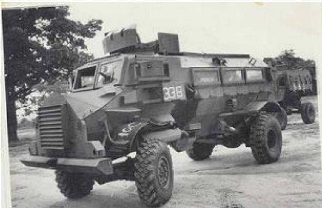
Fig. 7: The SADF Casspir Call Sign 33B with a Buffalo Mine Protected Vehicle. Both vehicles were captured at the battle at Indungo on 31 October 1987 and displayed by Cuban soldiers.