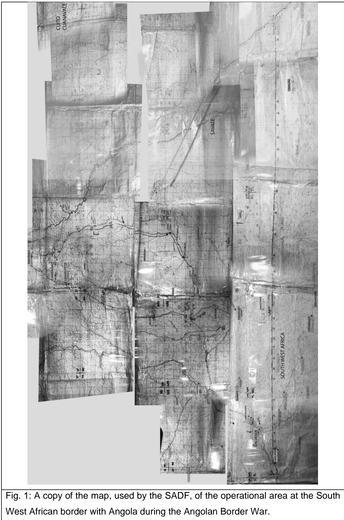
Fig. 1: A copy of the map, used by the SADF, of the operational area at the South West African border with Angola during the Angolan Border War.