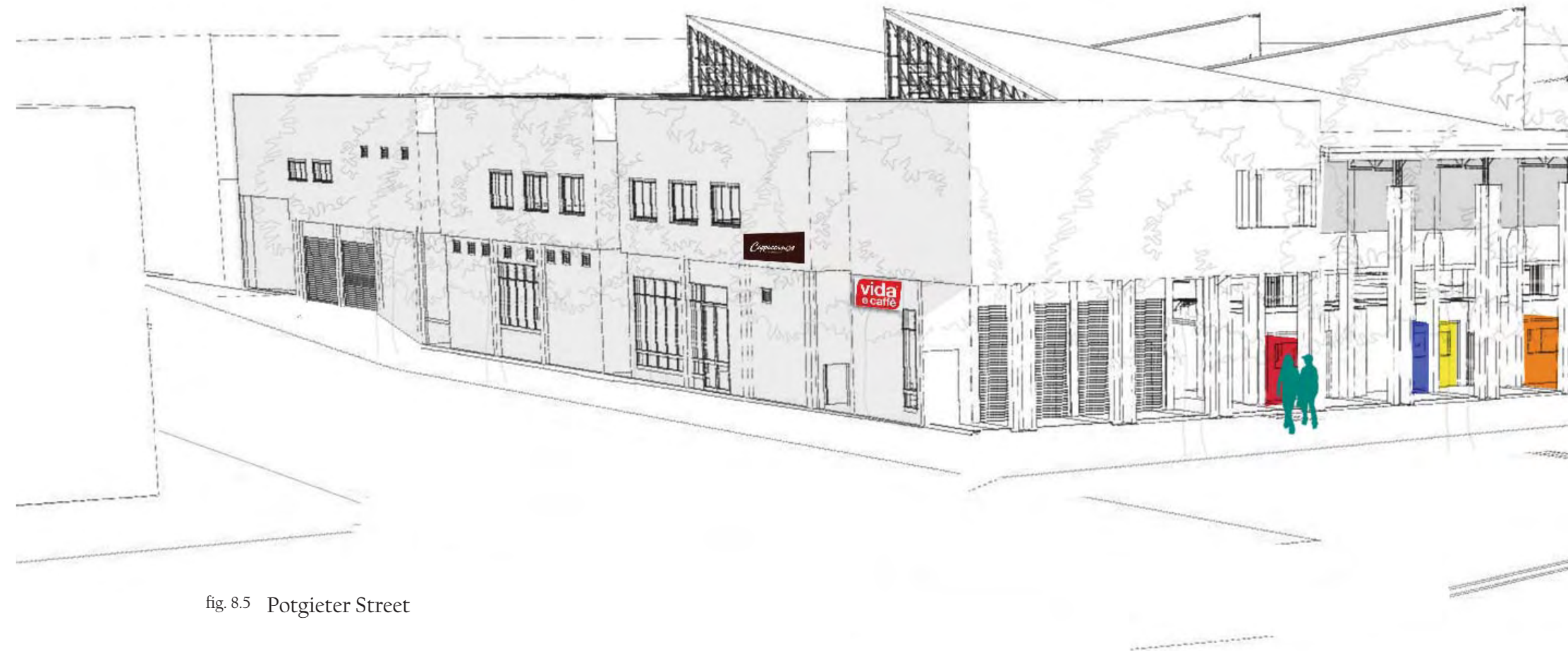
fig. 8.5 Potgieter Street