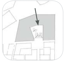
fig. 8.7 Main Entrance of the Market