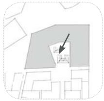
fig. 8.8 Historic Houses form the focus point of the market