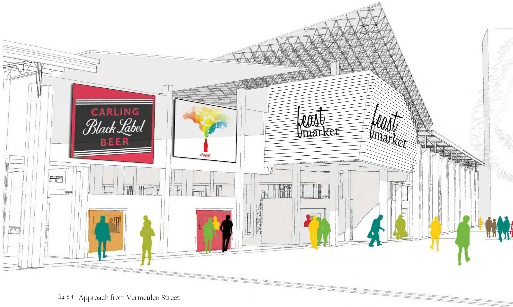
fig. 8.4 Approach from Vermeulen Street