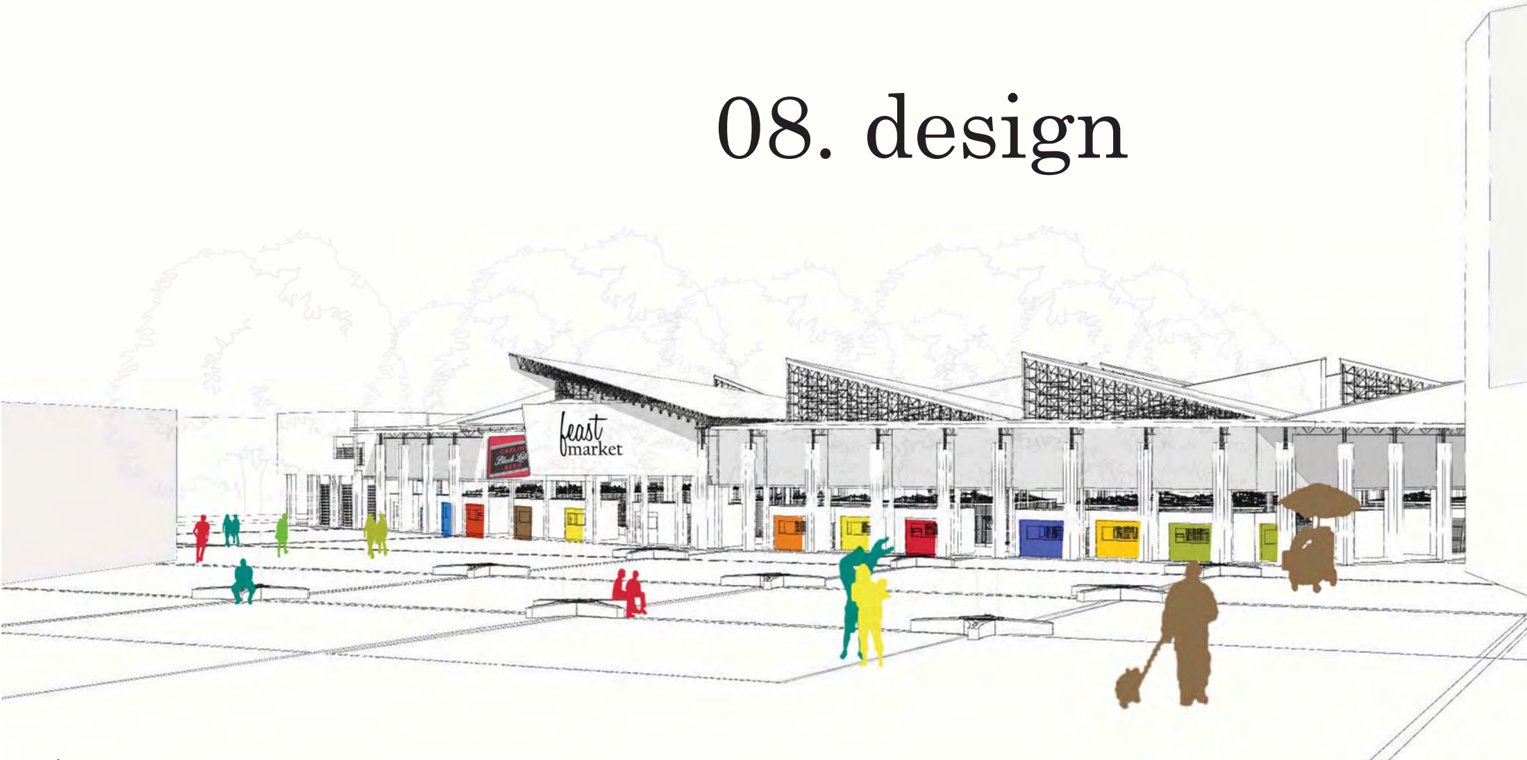
fig. 8.1 View from the North