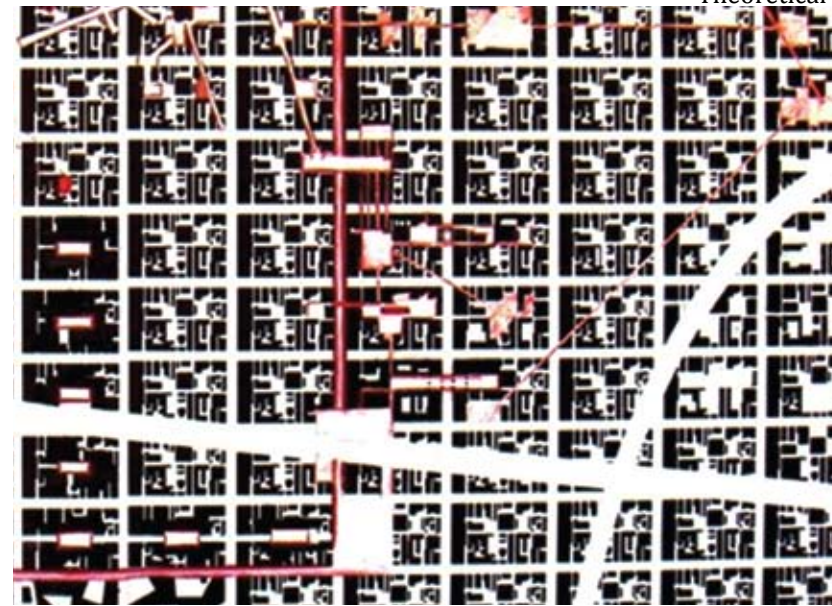
Fig. 108 Block investigation : Schizo Framework Group