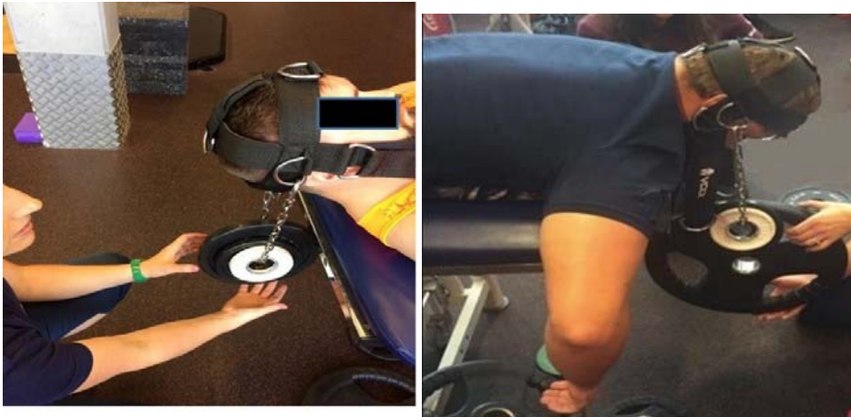
Supplementary FIGURE B. Isometric endurance test with head harness for (i) flexion and (ii) extension.