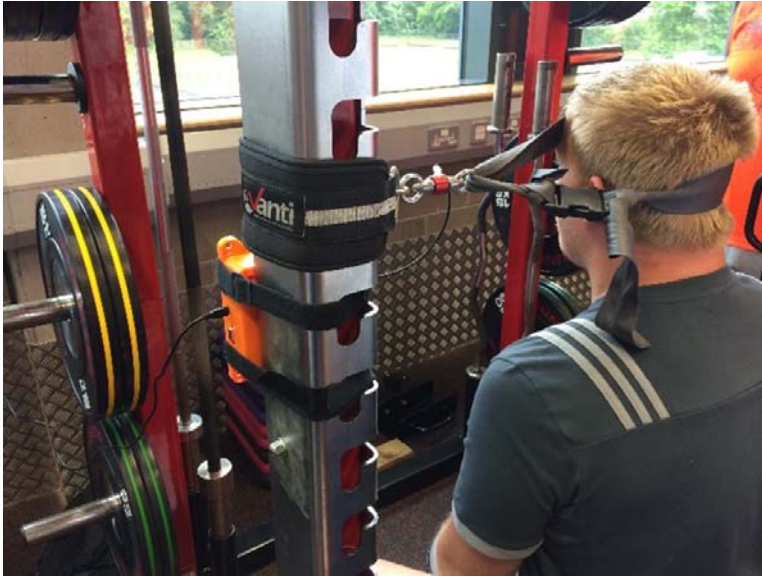
Supplementary FIGURE A. Peak isometric strength test (right lateral flexion). Players were seated in an upright position with the head kept in neutral position, hands by the side holding onto the seat base, feet hip width apart and flat on the floor throughout the test. A slack harness was placed around their forehead across the frontal and parietal bones above the ear line. The strain gauge was in line with the direction of movement. Flexion was performed with the same set up in the opposite direction.