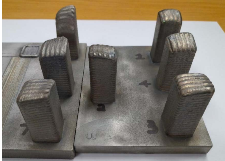
Figure 9: An image showing the manufactured TiB/Ti6Al4V composite samples.