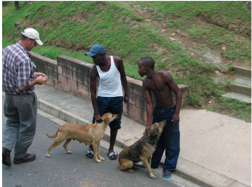
Lining up dogs for vaccination in a village in KwaZulu Natal Province.

ing to 20–30 deaths. However, concern is growing that there could be a significant increase in rabies as a consequence of the alarming rate of HIV/AIDS in the country. In some KZN villages, the HIV infection rate is 60–80%. When dog owners die of AIDS, the animals typically are abandoned to roam. Moreover, because poverty is widespread, even dogs with healthy owners may wander in packs searching for food. Because rabies is endemic among dogs along the east coast of RSA, AIDS thus could accelerate a rabies epidemic among humans from dogs, unless better control practices are reestablished.