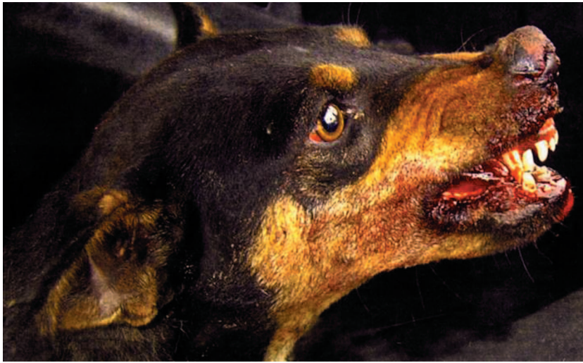
Dog with rabies from KwaZulu Natal Province, Republic of South Africa.

low mongoose being the principal vector of the virus.