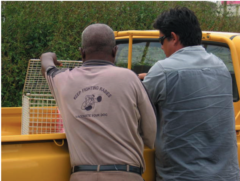
Rabies control team in KwaZulu natal province.

The extent of efforts to vaccinate dogs against rabies is the key factor in the variable incidence of the disease. Postexposure prophylaxis in KZN is currently well managed; free treatment is available to all bite victims who are in danger of contracting rabies, and more than $2 million (U.S.) is spent annually on human rabies vaccine. Further, a 24-hour rabies phone service is available to assist physicians and hospitals in identifying such patients and guiding plans to treat them.