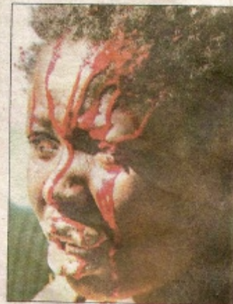
□ A Zimbabwean woman after being beaten up in a tavern at the Zulu Hostel in Alexandra.

after a meeting of about 200 Alex residents who decided to give foreigners an ultimatum: get out or be driven out.