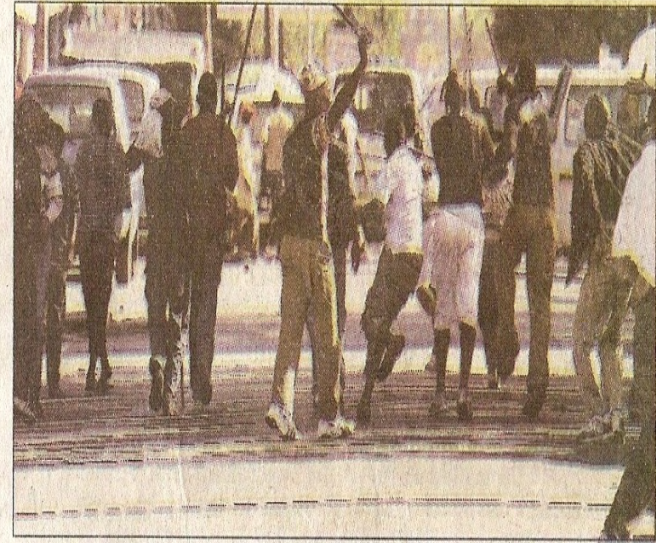
□ A group of men apparently involved in the xenophobic attacks on the rampage in Alexandra.

"We have a case of people distrusting their own government and Home Affairs," Pina said, explaining that there appeared to be a general assumption that identity documents carried by white people were legitimate while there was "huge mistrust of documents carried by the black African migrant".