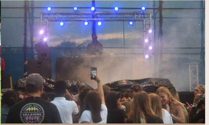
Zakes Bantwini in action