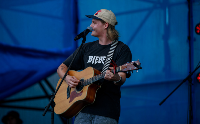
Droomsindroom on stage