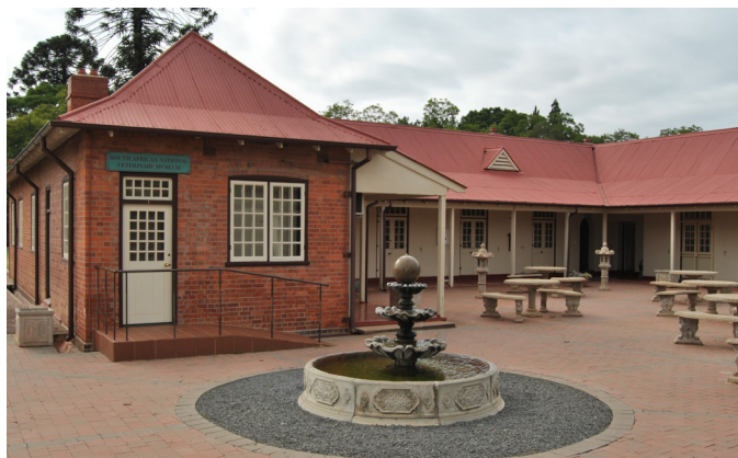
South African National Veterinary Museum in the 'Old Hostel' at Onderstepoort.