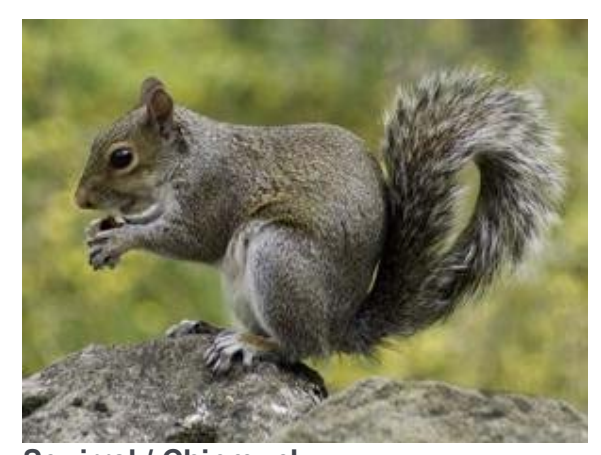
Squirrel / Chipmunk