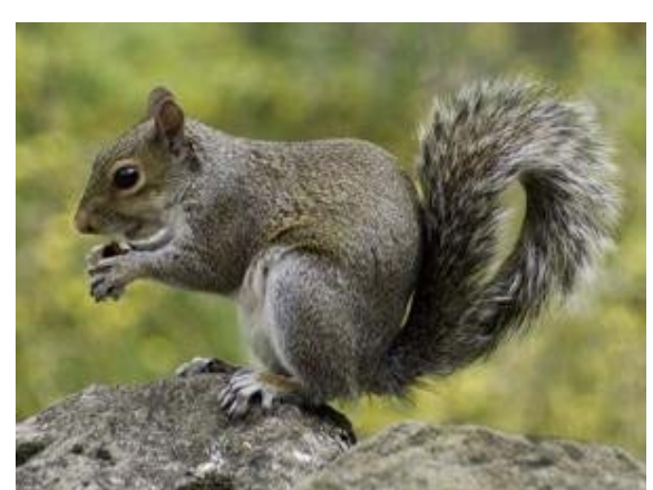
Squirrel / Chipmunk