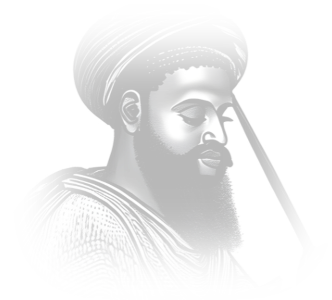
Figure 2: Al generated image by the author of his interpretation of Mūsā