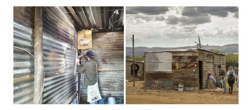
Plate 1. Example of a typical dwelling that were selected for the study

A local weather station was installed in the community to collect the local micro climatic data. An HP200 Wi-Fi wireless weather station was used, it functions between -30 and +65 °C, 0–99% relative humidity and wind speeds of up to 30 m/s. It was located in an open vegetated area with no overshadowing and within 800 m of the sample dwellings.