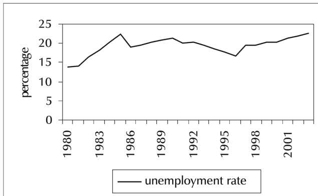
Figure 2 Unemployment rate