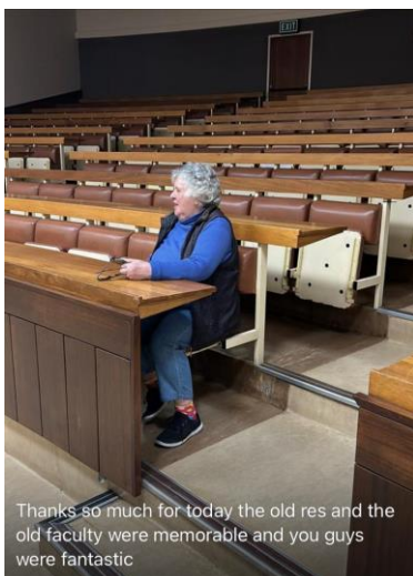
Thanks so much for today the old res and the old faculty were memorable and you guys were fantastic