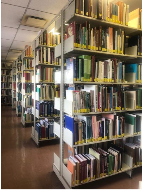
Newly moved book collection