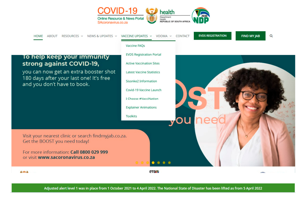
Figure 3. Website 1 (https://sacoronavirus.co.za/, accessed on 26 February 2023).

From a KMS perspective, the two websites provided different sources of information and knowledge. The main focus of the website in Figure 3 was to present daily and weekly COVID-19 cases, such as the number of vaccinations, the number of deaths, the recovery rates and the vaccines administered. The website (Figure 3) was dedicated to the COVID-19 pandemic and only contained information and data relevant to the topic. The second website, depicted in Figure 4, focused on management information (e.g., transitional measures), legislation, definitions of the different lockdown levels (alert levels), travel restrictions, home safety tips and organisational safety guidelines concerning COVID-19. This website (Figure 4) was not dedicated to the pandemic only as it contained information about other health-related services provided by the Department of Health. Both sites provided the standard website search and site map capabilities. The website in Figure 3 utilised a revolving banner to communicate multiple aspects regarding the pandemic and made it difficult to find the information the researchers were looking for quickly since it displayed too much in an unstructured manner.