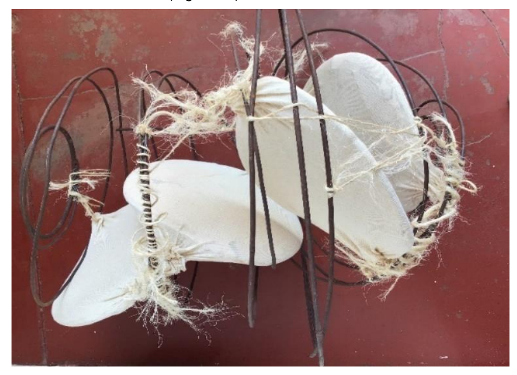
Figure 53: Sketch in Metal and Mutton Cloth, 2022. 6 mm metal rod discarded chair seats covered with mutton cloth. Size: variable, depending on placement.