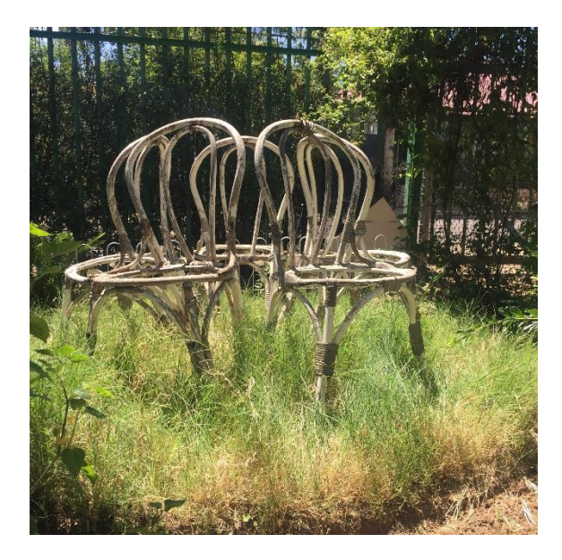
Figures 22 & 23: Water Way, 2023. Thinking and making process for the garden fountain. Size: variable

A conversation would usually take place regardless of the array of languages. Many French-speaking pedestrians were from the francophone states in Africa and conversed in French and their own cultural language, but not in English and as I don't speak French communication was sometimes a mixture of hand signs, body language, gestures and broken sentences. My materials prompted passers-by to share the signified responses evoked in their memories. Kester (2001: 3) notes that the viewer's desire to communicate their response to the art object to the artist is important, as it breaks down the barrier that often exists between strangers. The tendency to objectify an unknown person due to differences subsides when a non-confrontational, informal talking point is established. For me, bricolage situated my art practice as a process-led, practice-led, community-orientated research methodology that naturally led to the construction of assemblage as my method of creation. This was a strongly organic and intuitive process in which I delved into my collection of stored materials to tinker into being an art object made up of repurposed materials.