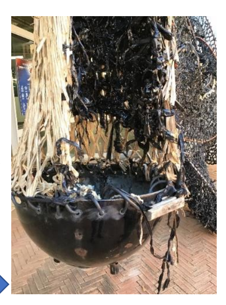
Figure 42: Black dome, 2022. Mixed media, braai bowl, shredded cardboard, strips of garbage plastic. Size: variable.

I improvised tools and considered any instrument at hand to work the material. I crocheted with hazard tape and strips of plastic of various softness using a 20 mm crochet hook. For the Interlocutor Assemblage body of work, I included a starting point or base in the form of a found object, which ranged across a rusted metal 100 cm circular container, a black braai bowl, a green plastic lounging chair, hose pipe, pieces of varnished broom sticks and a rejected satellite dish. The artworks shown in Figures 41 and 42 combined found materials with no relation to each other, but in both artworks, I weaved and crocheted the repurposed materials of plastic garbage bags and shredded cardboard to create texture and tactility that could evoke curiosity in viewers.