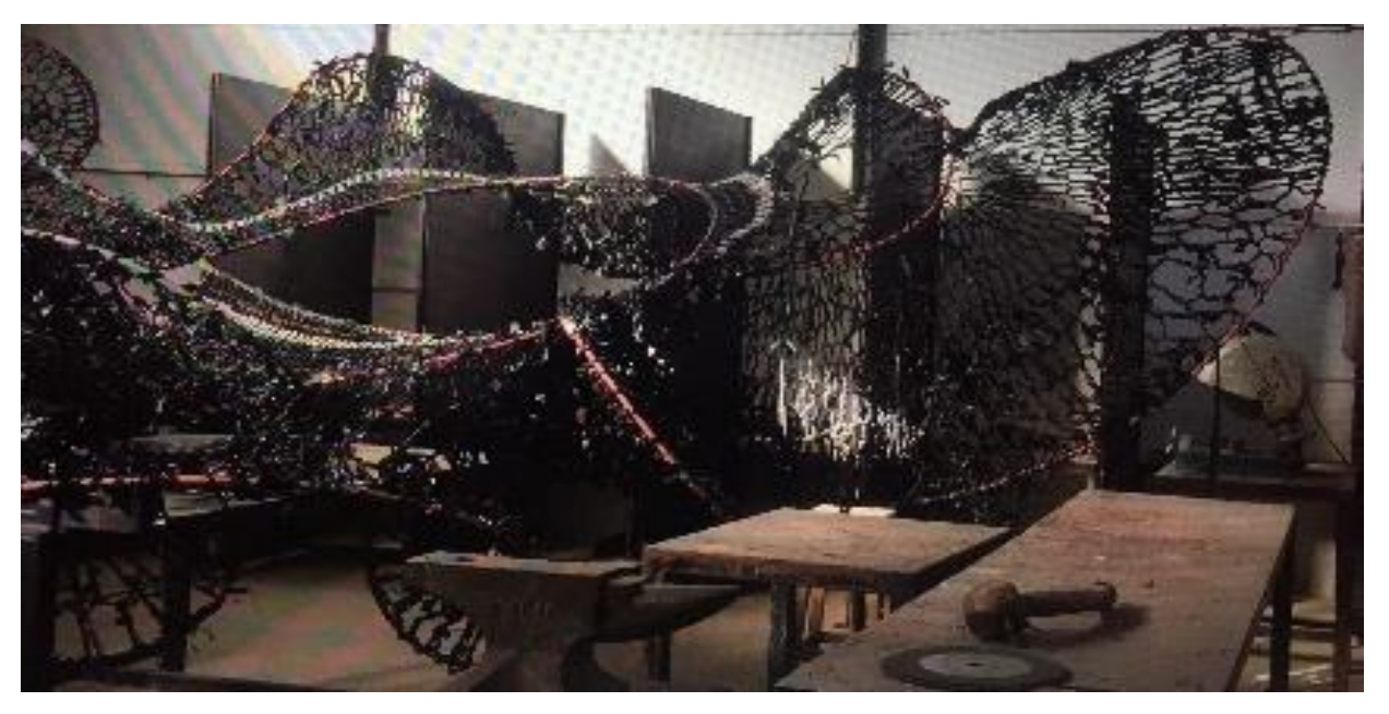
Figure 44: Black Oblivion, 2022. Plastic and plumbing tubing. Size: variable.

I used old baskets, upholstered seats in mutton cloth, shredded packing cardboard, hessian string, plastic washing line, plumbing tubing and old electrical cords in various states of disrepair or deterioration, and more. These offered an alternative to traditional purchased materials. I combined mainstream industrial methodologies like welding and bronze casting with craft practices such as the weaving and crocheting of hazard tape and discarded plastic. The materials' history, previous use and commercial status worked with the combination of contradictory objects. I reconstituted the materials with a primary focus on texture, materiality, and cultural significance to the local community. I exploited tactile intensity and disregarded traditionally harmonious combinations, using the muted colours of bronze with the garish colours of plastic or found objects, or a discarded satellite dish with an empty hanging basket. Materials were not casually or loosely juxtaposed but were carefully and deliberately woven, knotted, crocheted, and stitched to suggest or create new relationships. I paid careful attention not to destroy the indeterminateness, chance, and mobility that Dezeuze (2008: 31) refers to. I almost obsessively repeated the weaving and crocheting of the materials in or on found objects in several art works, perhaps an unconscious attempt to instil order and control on the seeming chaos and detritus I witnessed around me daily.