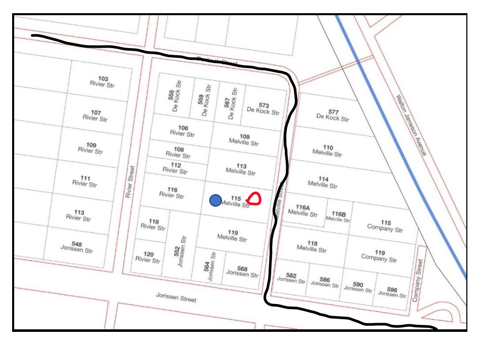
Figure 4: Street map illustrating the position of my home at 115 Melville Street.

The route down De Kock Street (instead of Jorissen Street) and up Melville Street (Figure 4) is a shortcut to the affluent east of Pretoria and passes my home studio; this route is the focus area of my study because it is less formal and does not obstruct the traffic. It is also a section of Sunnyside that is not policed as the main traffic routes and presents less chance for illegal migrants to be scrutinised.