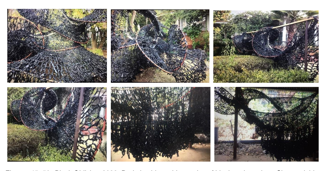
Figures 45–50: Black Oblivion , 2022. Red plumbing tubing, strips of black garbage bag. Size: variable. Installation view in home garden studio and South Campus studio.

With my use of bricolage the materiality of my objects is not secondary to the form or used to enhance and uphold the form because the concept differs between individuals and function. Moniker Wagner (2015: 8) states in relation to bricolage , material is the primary information carrier. Bricolage materials carry a history, so the choice of material used in my work needed to be relevant to the culture of the viewer.