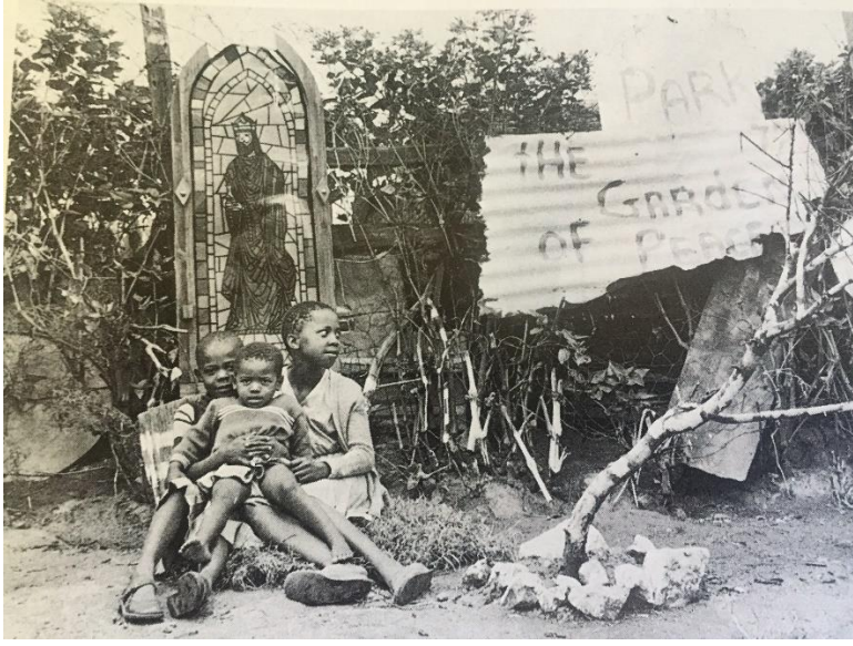
Figure 16: Only the poor feel it, 1985. Oukasie township, Brits. Sack, 1989)