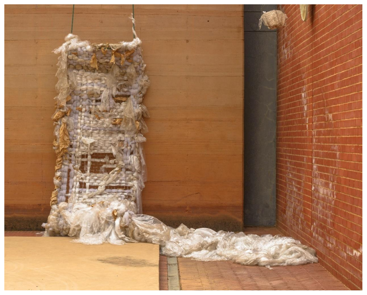
Figure 65: The Wave, 2023. Sculpture courtyard, University of Pretoria. Size:8 x 2.5m. Photograph:

The art object provokes the viewer to draw on their own collective experience to decode it subjectively and emotionally. Viewers' individual and collective experiences of the work make them part of a bricolage assemblage through their psychological absorption when responding to the tactility of materials. This sensual experience of looking takes place publicly, but the decoding takes place in the privacy of the viewer's mind. The Interlocutor Assemblage was integral to spectator participation because each work's materiality was grounded in the exploitation of a found object's basic form (e.g., a metal circle, a broken stand, a rubber loop) through a bricolage -based craft application like crocheting, threading, weaving, or knotting. This is similar to Scott (Figure 12), who starts most of her art objects on a structure or armature.