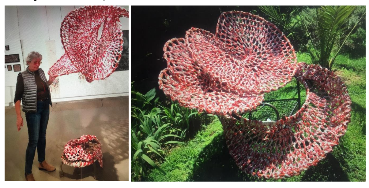
Figures 39 and 40: Red Hazard , 2021. Size: variable. (PAM Gallery and on an old garden chair in my garden studio).

counter with the chair, including green hosepipe and same size varnished wooden broomsticks. The materiality of these articles seeped into my mind gradually and organically. Eventually, in a spare teaching period, I started to weave the hosepipe into and through the gaps in the plastic chair. Students witnessed my making process and were amused by the gardener's alarm that I might include his hosepipe. As the sculpture took shape, I needed more tools and a clamp, so I moved it to the University of Pretoria's sculpture studio to complete it. The finished object hung in the communal section of the sculpture room until it was delivered to the Pretoria Art Museum, where it was selected with Red Hazard (Figures 5, 18,19,39, 40,) into the top hundred of the Sasol New Signatures Art Competition.