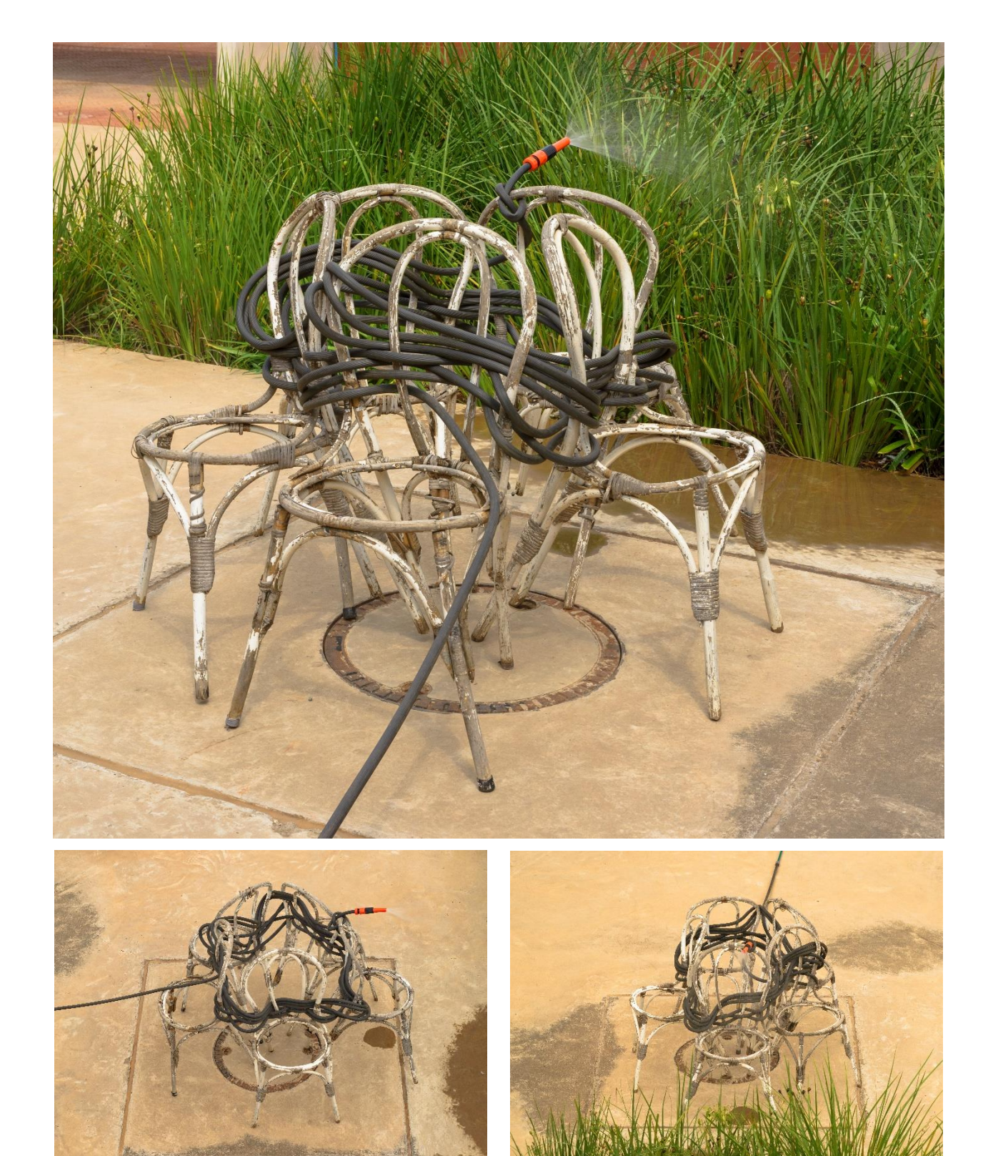
Figures 71–73: Water Way, 2023. Final placement in sculpture courtyard, University of Pretoria. Size: radius of 1.5 m x 85cm.