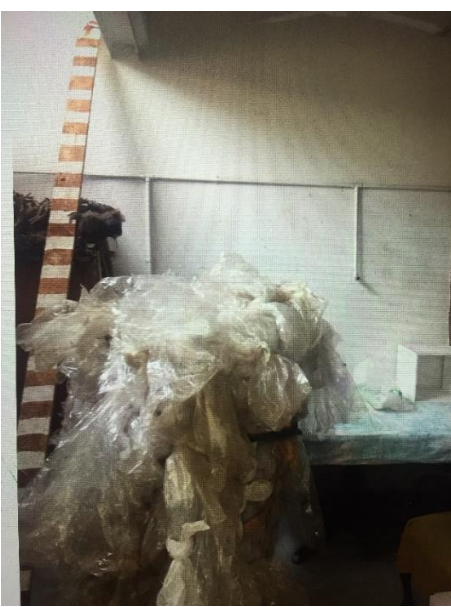
Figures 28 and 29: Discarded material in South Campus studio, 2022. Sizes: variable.