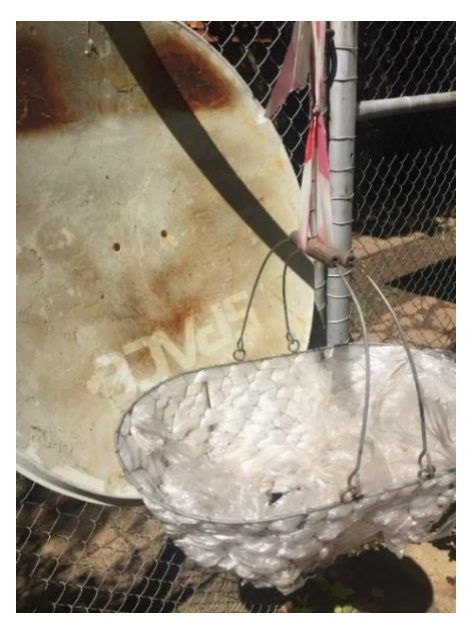
Figures 34 & 35: Nest Wave, 2022. Found dish, discarded basket and transparent plastic. Size: 80 x 60

I was moving Nest Wave around even as I was busy making other art objects. It was important to me that the work not be at the same height as a functional satellite dish. This work was easily visible, and the combination of signifiers was clearly recognisable to viewers, whose signified responses were varied. Several spectators found it amusing and made suggestions about what to place in the basket, which was perceived as an open statement, especially as its bottom section was not finished off. Many viewers were intrigued by my eventual placement of two wrapped avocados in the basket, as people often do to encourage the ripening of the fruit.