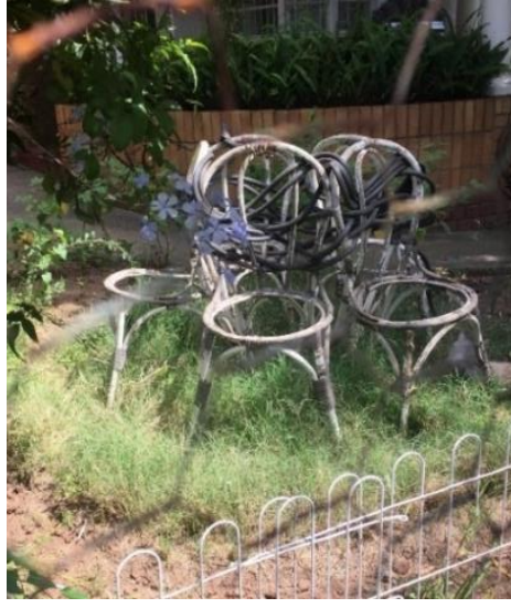
Figure 26 and 27: Repurposed Bentwood chairs in process of being moved to different venues, 2023. Sizes: variable.