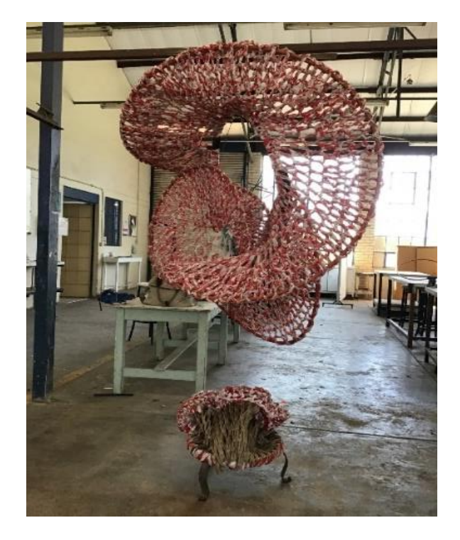
Figure 5: Red Hazard (in progress), 2021. Mixed media, hazard tape, shredded cardboard and found objects. Size: variable.

alternative and inclusive studio practice through socially engaged, participatory and site-responsive assemblage and bricolage .