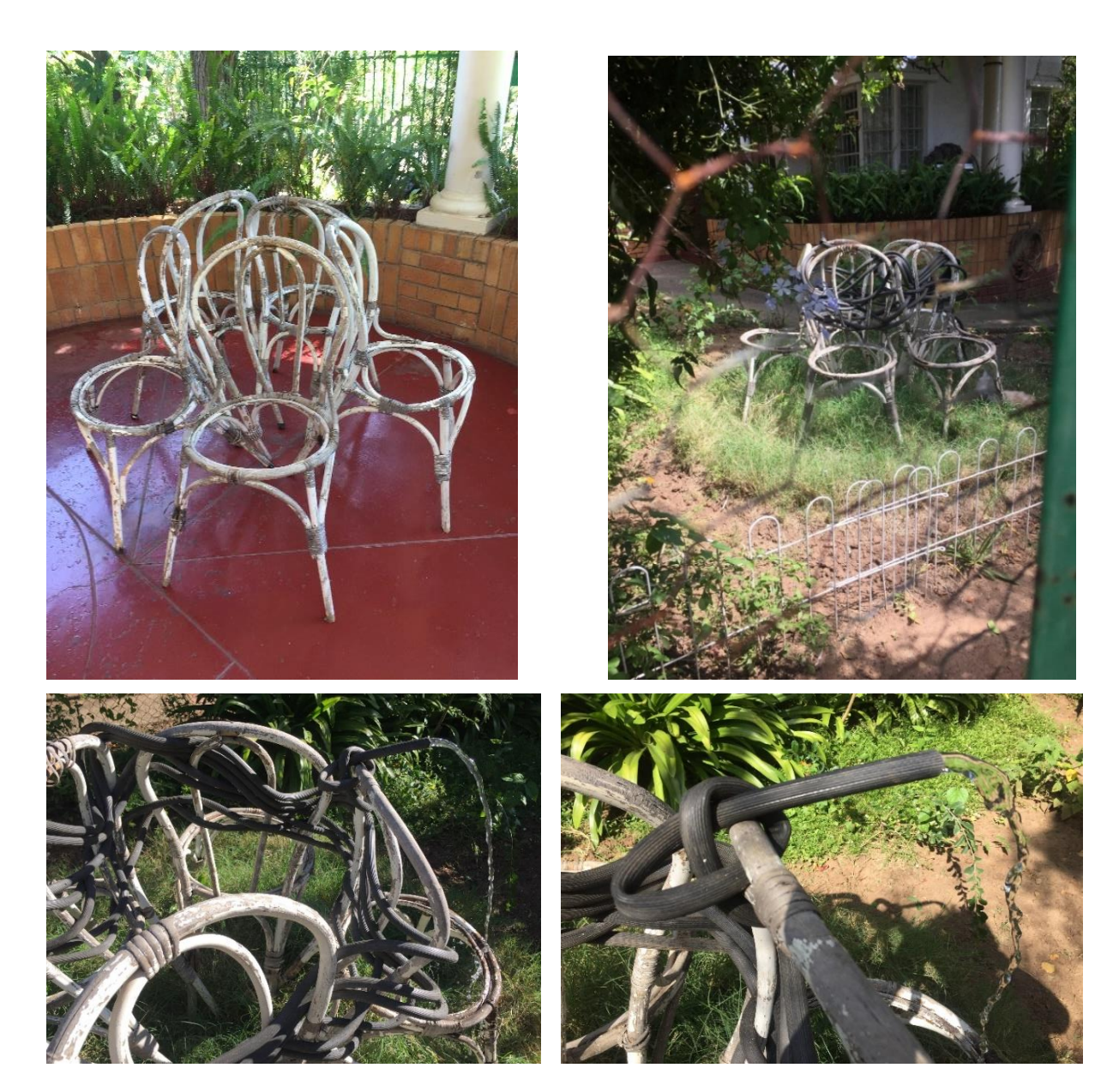
Figures 67–70: Water Way , 2023. Discarded bentwood chairs and hose pipe. Size: radius of 1.5 m x 85cm

object to offer the possibility of an open work in order to be inclusive of all viewership. Multicultural discourse requires thinking and creative methodologies that seek to enhance both an objective and subjective stance to achieve inclusive, respectful communication that facilitates the passing of oral traditions from generation to generation in a reverent adherence to group identities.