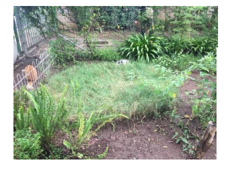
Figures 20 & 21: Structures and areas used as plinths and platforms, 2020 onwards. Sizes: variable.