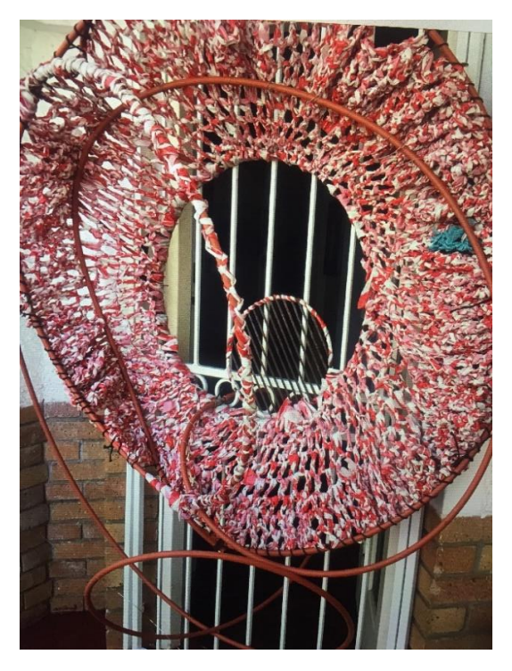
Figures 18 & 19: Red Hazard in progress, 2021. Red hazard tape and plumbing tubing. Size: variable