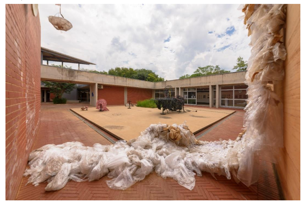
Figure 37: A view of the Interlocutor Assemblage showing placement of the Nest Wave , 2023. University of Pretoria's sculpture courtyard. Size: variable.

Chapter three explains the processes of the first and second sort of my collection of materials to achieve order in what I found to be a chaotic situation. Many participants provided me with material but also contributed to the conceptualising of the art objects. I hesitated to throw anything away and even kept the used filters after servicing my car for possible use as embroidery and smocking. I examined my neighbour's garbage bins and considered Styrofoam supports and packaging of expensive electrical sound equipment found on their pavements as elements of