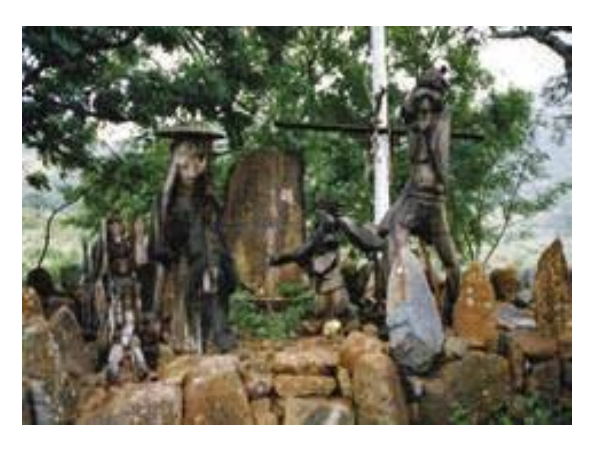
Figure 8: Jackson Hlungwane, Altar of Christ , 1993. Wood and stone. Size: variable. Photograph: Lee Van Wyk.