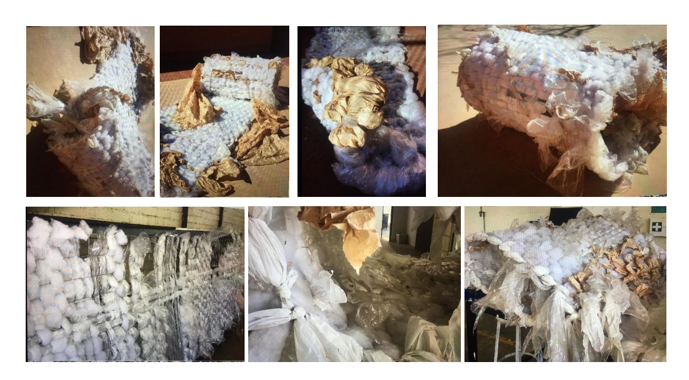
Figures 57–63. The Wave (in progress), 2021. Aluminium fencing with plastic, brown paper, duvet foam. Size 5 \text{ m} \times 2.5 \text{ m} .