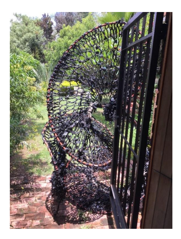
Figure 6: Black Oblivion (in progress), 2022. Mixed media, plumbing piping and black garbage bag plastic. Size: variable.