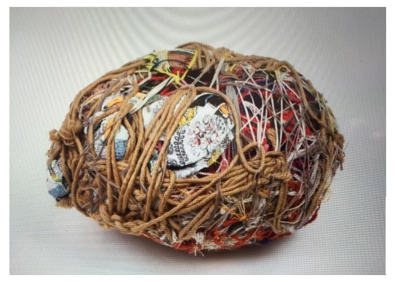
Figure 12: Judith Scott, Untitled, 2003. Size: unknown. Medium: mixed scraps of fabric and fibres.

Artists working outside the canon or beyond the mainstream market who focus on non-Western narratives include artists with disabilities or mental illness (Millington 2003) and others who do not fit comfortably into mainstream society, such as the homeless, ethnic minorities and migrants of subaltern status.