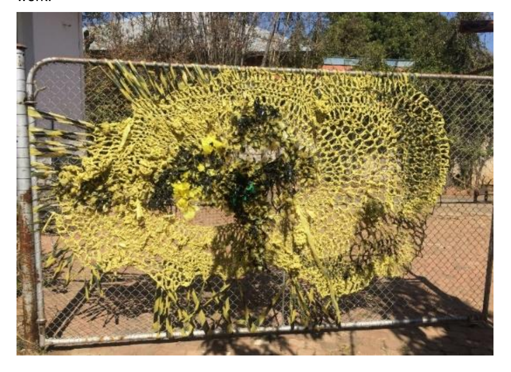
Figure 1: Gated Skin, 2020. Crocheted plastic and hazard tape, 270 x 170 cm. Installation at the entrance to the artist's home, Sunnyside, Pretoria. An example from my fourth-year exhibition, Skin Series.

Sunnyside is a unique model for immersed creativity and innovation due to its informality, lack of social inhibition and disregard for the establishment. These elements are abundantly visible in informal sidewalk businesses and hastily constructed dwellings on public walkways. It appears to be populated by a diverse citizenry, some with no specific vested interest in the area or living from hand to mouth; some are illegal immigrants fleeing severe circumstances in their countries of origin (United Nations High Commissioner for refugees, displaced and stateless people in southern Africa photo exhibition 2022). I met many Ethiopian nationals who are in Sunnyside after leaving civil war and famine in their country. In conversation, I also learned that many of the pedestrians are young professionals using cheap accommodation to easily access their place of work.