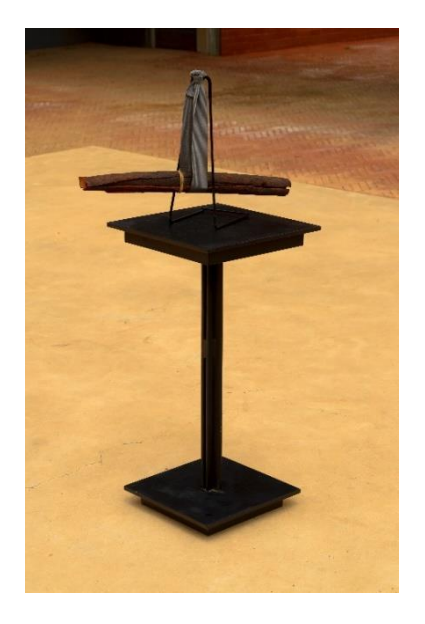
Figure 43: Bark Scroll , 2023. Tree bark, animal skin, metal frame, car seat belt. Size: 35 x 40 x 8 cm. Photograph: Rupert de Beer.

I improvised tools and considered any instrument at hand to work the material. I crocheted with hazard tape and strips of plastic of various softness using a 20 mm crochet hook. For the Interlocutor Assemblage body of work, I included a starting point or base in the form of a found object, which ranged across a rusted metal 100 cm circular container, a black braai bowl, a green plastic lounging chair, hose pipe, pieces of varnished broom sticks and a rejected satellite dish. The artworks shown in Figures 41 and 42 combined found materials with no relation to each other, but in both artworks, I weaved and crocheted the repurposed materials of plastic garbage bags and shredded cardboard to create texture and tactility that could evoke curiosity in viewers.