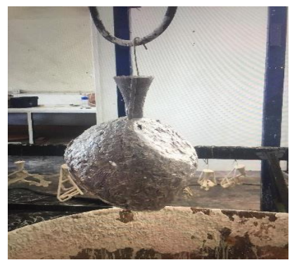
Figure 36: Various stages of casting and placing the bronze gourd in preparation for the final assemblage. Sizes: vary.