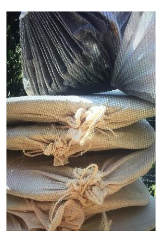
Figures 30, 31 & 32: Examples of the material collected and rearranged from time to time.

During this process, more and more pedestrians stopped to peer through the palisade fence. They questioned, debated, and offered advice, and I, in turn enquired about their situations. I gradually became aware of the challenges that migrants in Sunnyside faced, as some expressed their concern with losing their cultural identity amidst the busy South African culture. I became sensitised to the challenges faced by Africans residing near me, who were negotiating their own identities within South African culture.