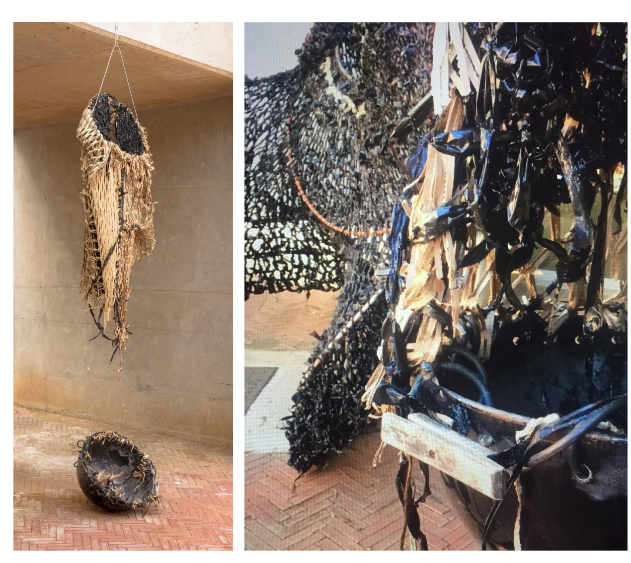
Figures 51 & 52: Black Dome , 2023. Left: In the sculpture courtyard. Right: Presented for a master's critique in 2022. Size: variable.

I found Deleuze and Guattari's (2021:5) rhizomatic thinking model of never-ending and becoming preferable to that of a closed, static form that is less inviting to the fast-moving spectator. The open-ended, rambling, tactile form does not represent anything recognisable, and this and a lack of context make it unlikely that a pedestrian could overlook an art object such as Black Oblivion (Figure 45 and 50) as they speed to their destination. According to Maas (in Jordaan 1990: 348) this allows the viewer to impose their own context. Black Oblivion hints at an affiliation with Black Dome (Figure 52), Red Hazard (Figures 39 and 40) and The Swing (Figure 41) through their shared use of plastic, weaving and crocheting with the same size crochet hook and the same stitch size that create transparency and negative shapes.