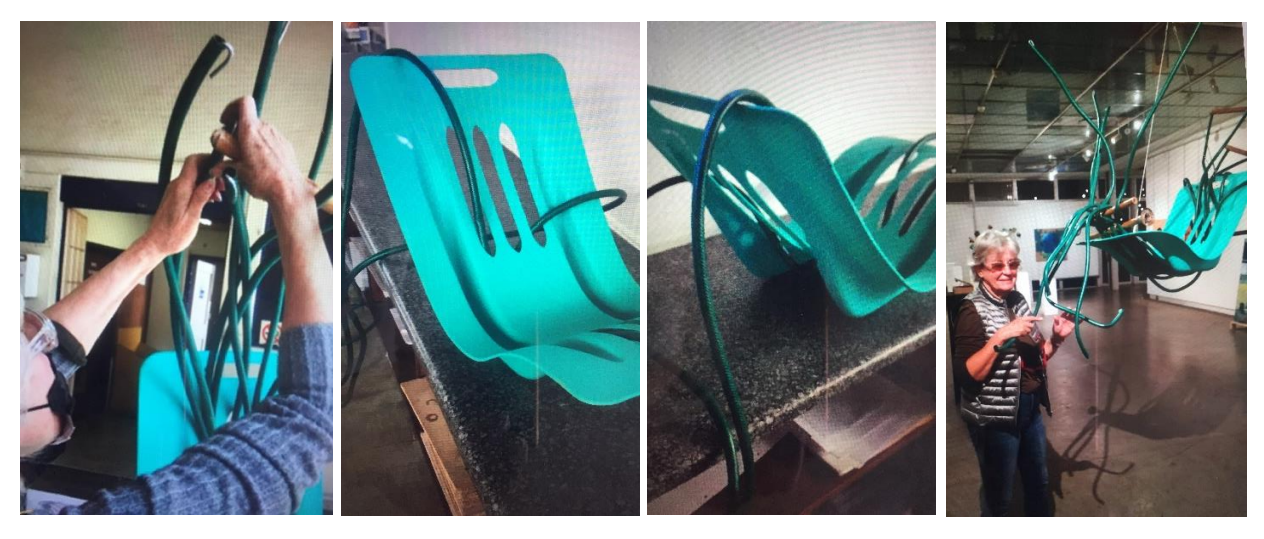
Figure 38: The Swing (methods and processes), 2021. Size: variable.

My process of doing was an empirical, pragmatic act of a naturalistic approach that viewed the knowledge gained from the doing process to be the next step, which was often the active application of advice from a spectator or an attempt from me to explain what I was doing. This attempt at explaining to an objective person demanded that I apply rational thought to my intuitive creative process. I welcomed the challenge of such explanations because they demanded deliberation and self-reflection and made my practice participatory, allowing me to indulge in a nomadic type of thought that organically encompassed the different opportunities and ideas offered. My home storeroom contained numerous gathered objects and materials. Some lay dormant, while I found others so interesting that I took them out and put them in view immediately. An object could offer an interesting sense of balance or tension, or even have a mysterious presence. Very little preparatory sketching or planning was ever necessary. I left objects in my line of sight or in and around the garden until they suggested their own formation.