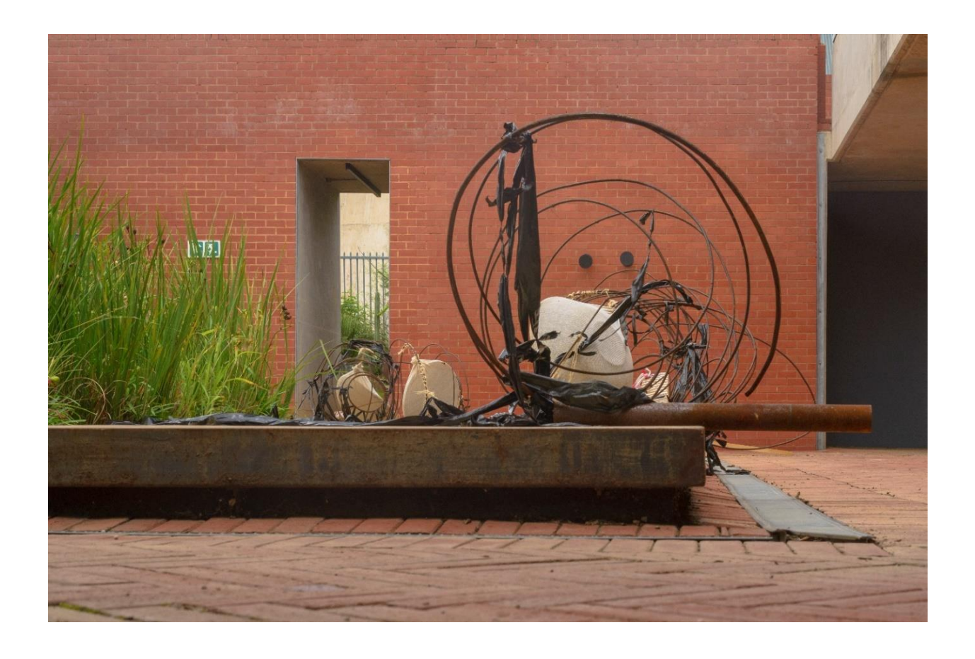
Figures 54–56: Unsettling Transformation , 2023. Wooden plank, metal spiral, mutton cloth, disc. Size: approximately 3 m x 1 m.