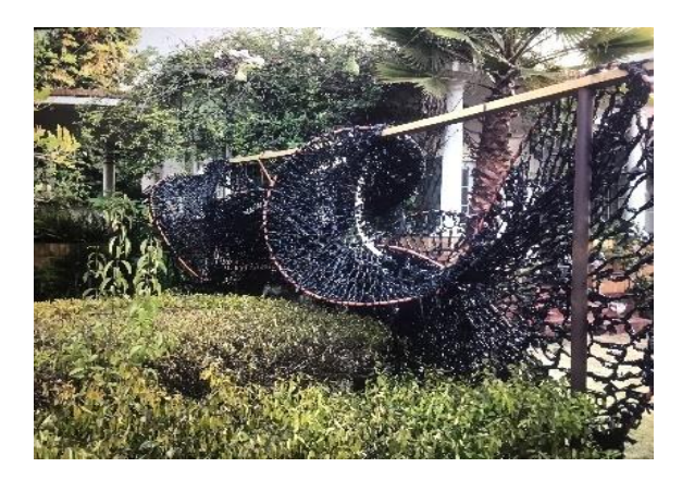
Figure 9: Carol Preston, Black Oblivion , 2022. Home garden studio.