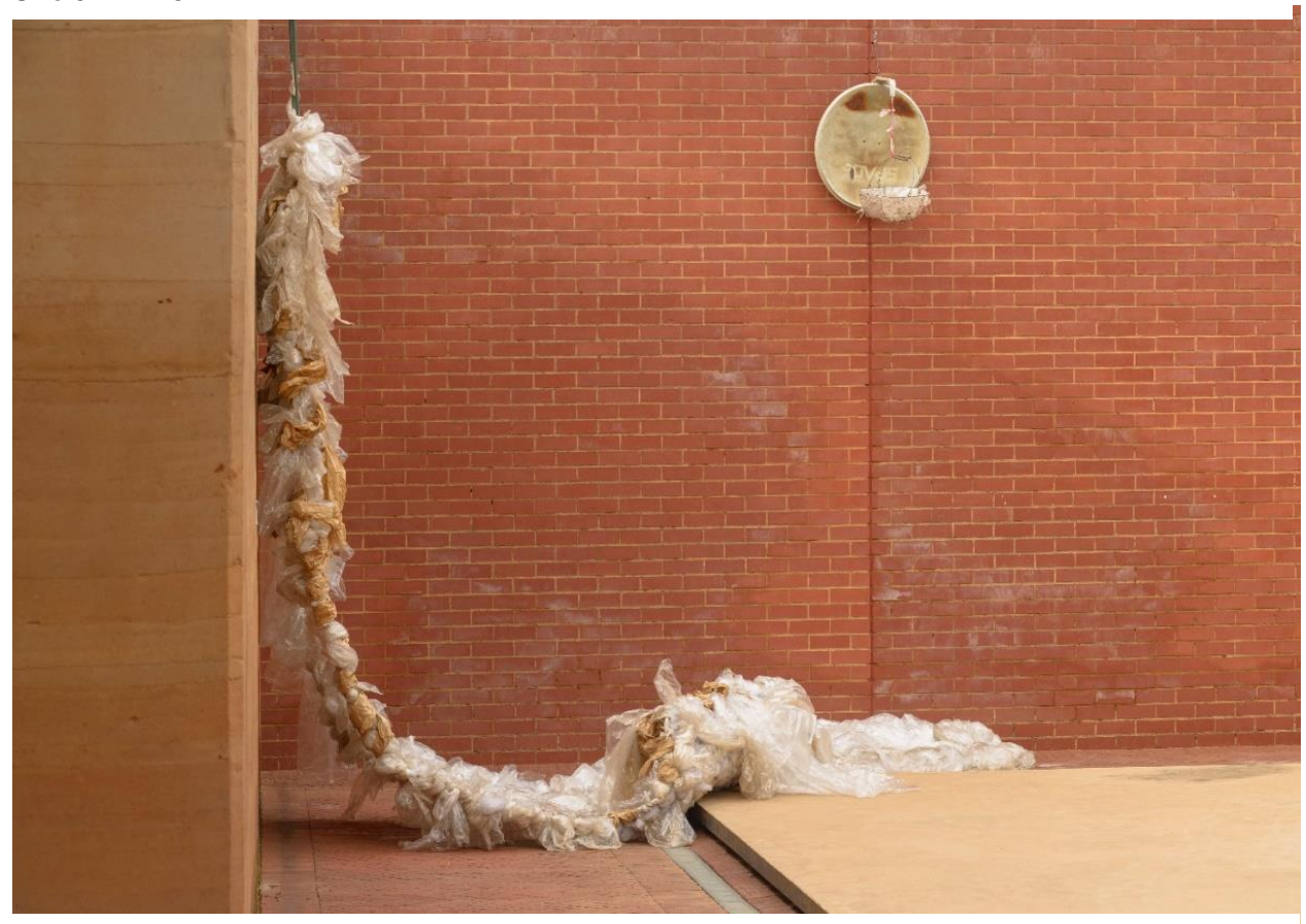
Figure 64: The Wave , 2023. Sculpture courtyard, University of Pretoria. Size: 8x2.5m.