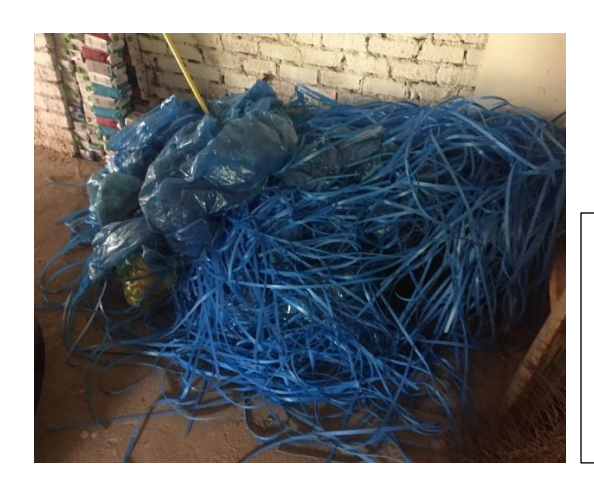
Figures 24 & 25: Material in storage, 2022. Mutton cloth, covered discs, plastic tape and sheets of blue plastic. Sizes: variable.

This open, polysemic viewership unexpectedly presented me with alternative criteria of assessment different from the conventional white-cube gallery perspective. The usual linear material methodologies of a closed statement were bypassed in favour of an interpretation of an artwork in the context of Sunnyside's multi-cultural demographic. Over the palisade fence, I debated the relationship between the individual and culture, the idea of aesthetics, placement, current and historical situations with passing residents and pedestrians. Art appreciation was considered in the local context, but also as a point of interest to wider Pretoria, as many international citizens passed my house on their way to Alliance Française in nearby River Street.