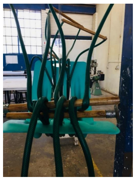
Figure 41: Swing , 2021. Mixed media, plastic sun lounger, hose pipe and broom sticks. Size: variable.

Figure 42: Black dome, 2022. Mixed media, braai bowl, shredded cardboard, strips of garbage plastic. Size: variable.