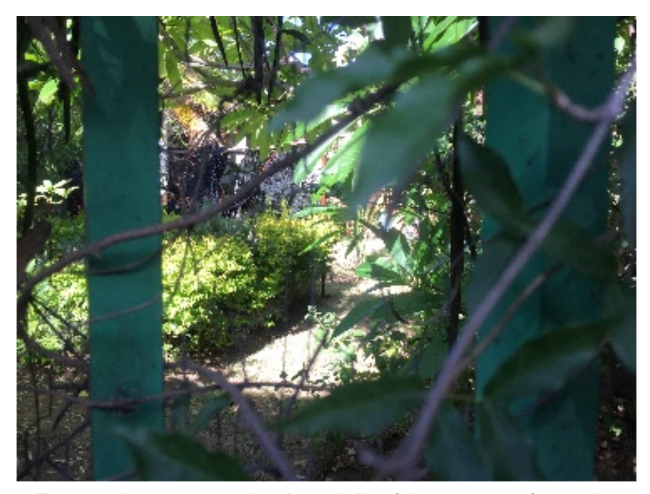
Figure 66: A glimpse through my palisade fence, with Black Oblivion in view, 2023. Size: variable.

objects. Instead of creating a body of work alone in a cloistered studio, to be presented in a conventional art gallery, I worked in and around my garden in full view of the public, resulting in a very different audience-artist relationship. Rose (2012: 260) states that the audience process produces spectatorship, and spectators develop complex and elaborate ways of interpreting the effects of art. Depending on the type of materials used, bricolage artworks can engage a viewer emotionally and socially Kester (2000: 1) advocates for this in his lecture on critical frameworks for littoral art).