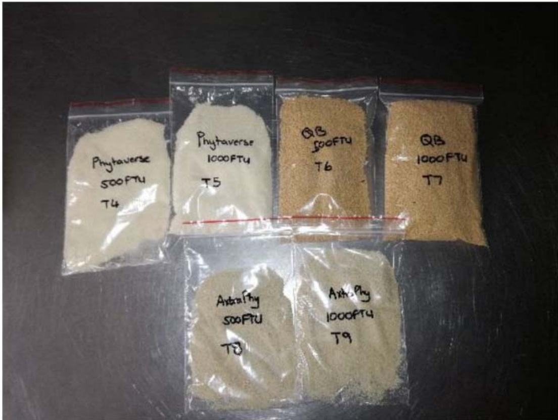
Fig. 1. Phytase enzymes that were used in the study. T4 and T5, Phytaverse (PTV), a modified E. coli phytase at 500/1000 FTU; T6 and T7, Quantum Blue (QB), an enhanced E. coli phytase at 500 and 1000 FTU; and T8 and T9, Axta-PHY (AxP), a Buttiauxella species bacterium-sourced phytase at 500 and 1000 FTU. [Colour online.]

from sodium phytate at pH 5.5 and 37 °C). The three phytases include Phytaverse (Novus International, St. Charles, MO, USA), Quantum Blue (AB Vista, Marlborough, UK), and AxP (DuPont, Wilmington, DE, USA). For each control, the finisher diets had a 0.11% reduction in avP as compared to the starter diet, and then treatments 4 to 9 consisted of NC1 with Phytaverse, Quantum Blue, or AxP at 500 or 1000 FTU/kg. The diets were formulated on Format Feed Formulation software (Format Solutions Ltd., Hopkins, USA) using the CVB (Dutch Net Energy) system and were mixed at Simple Grow Agricultural Services. Both diets were pelleted at temperatures set and monitored not to exceed 85 °C.