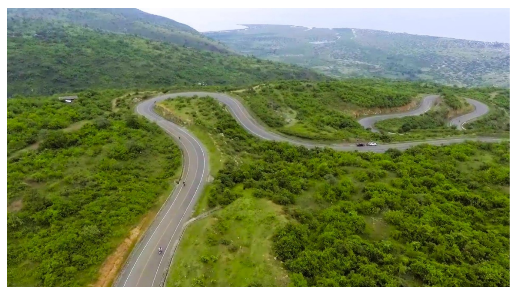
Figure 2: The road to Buliisa district after construction

In a post-satisfaction survey commissioned by Ministry of Lands Housing and Urban Development (MLHUD), communities reported increased individual and household incomes accruing from employment opportunities provided by the road construction project through provision of local employment, emergence of new businesses and new market opportunities. Communities also noted an increase in retail and wholesale business