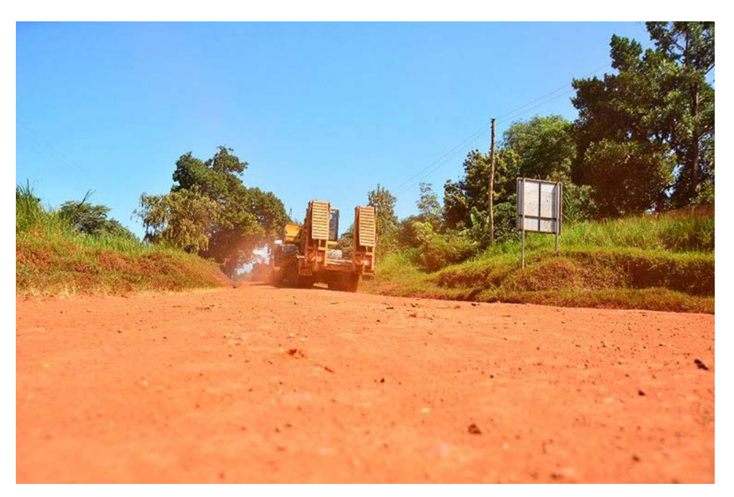
Figure 1: One of the roads under construction

ware outlets have opened and the collections from Trading Licenses have shot up from USD30,370 in 2020/21 financial year to USD36,216 in 2021/22 financial year." Figure 1 and 2 present the general state of roads in the study prior to construction and after construction respectively. Indeed, the project has resulted in better road provision in terms of quality and level of service.