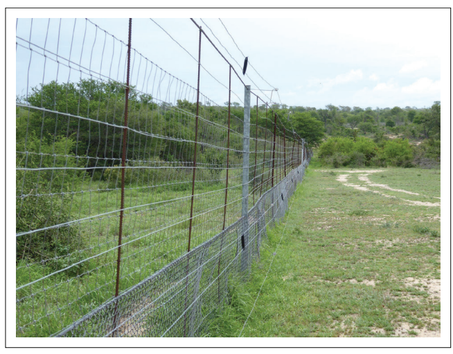
FIGURE 6: Fence-line contrast of a sodic site between full exclosure (left) and area open to herbivores (right) at the Nkhuhlu exclosures.

Thorough soil classification was done when the exclosures were erected (Paterson & Steenekamp 2003), but limited follow-up soil work has taken place. Jacobs et al. (2007) investigated nitrogen (N) fixation in Philenoptera violacea in the Nkhuhlu exclosure. They found that P. violacea fixes N and this ability varies with the soil conditions and life history stage; that is, leaves of saplings and juveniles fix higher levels of atmospheric N than mature plants. Although these studies utilised the exclosures as study sites, they did not compare N and phosphorus (P) limitation with and without herbivores or N fixation with and without herbivores. As part of their study on arthropod diversity in the two exclosures, Thoresen et al. (2021) measured a range of soil fertility indicators (including the macro-elements, pH and soil moisture), and found that herbivore exclusion increased both soil nutrients and moisture.