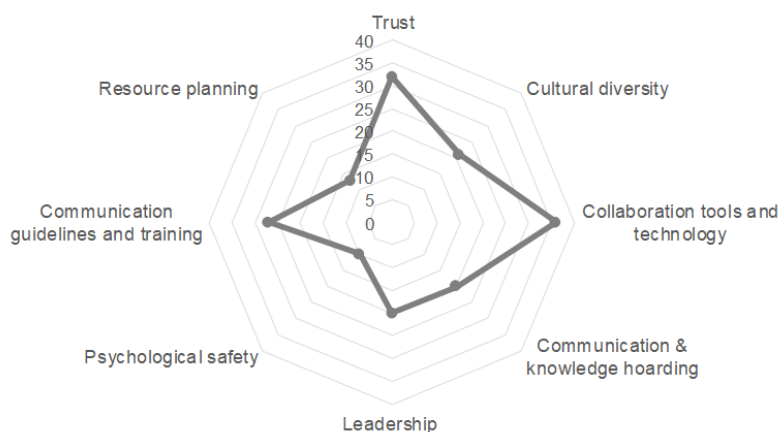
Fig. 2. Concept matrix theme analysis count

Consequently, eight common themes were identified in the review, as shown in Figure 2, highlighting the reviewed literature's frequency per theme. These themes were mapped per article to easily track and refer to specific articles during the literature review process.