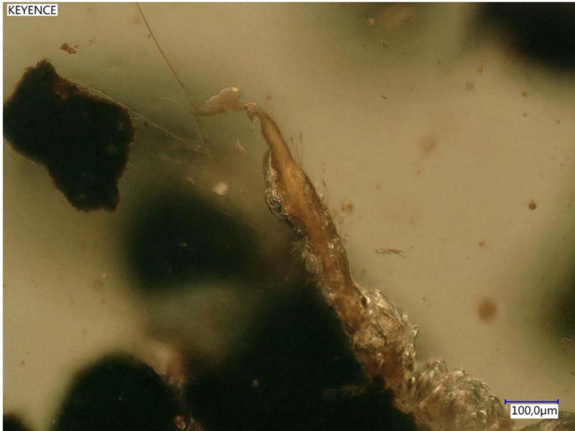
Supplementary figure 3: Tarsi from Cornupalpatum burmanicum grasping a barb from a feather.