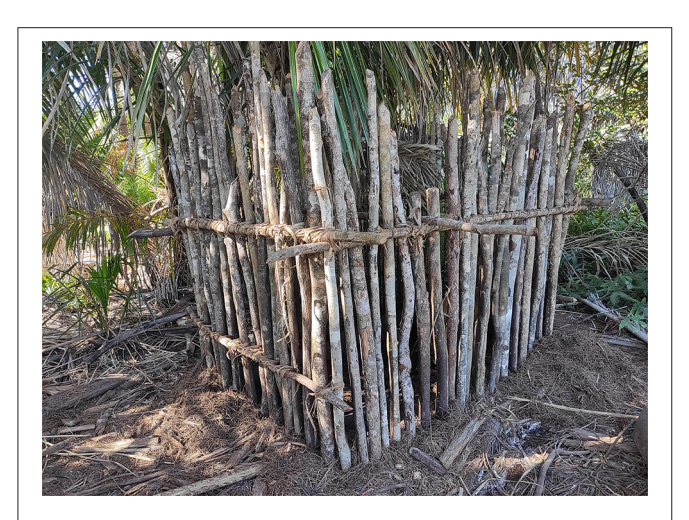
FIGURE 2 | Traditional wooden hand-made traps (Kotona), 2015 (Source: Rianja Rakotoarivony).

(minimum 1, median 5, maximum 50). Similarly, when kotona were used, a hunter used an average of 1.9 kotona per hunting season (minimum 1, median 2, maximum 5). There were no significant differences between the hunting techniques used per region, except for the spear, which was more commonly used in the SSW region.