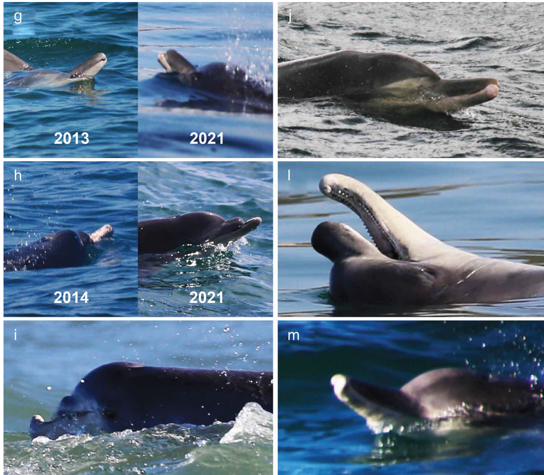
Figure 2 Continued

the presence of an associated calf. The sex of all the other individuals remains undetermined.