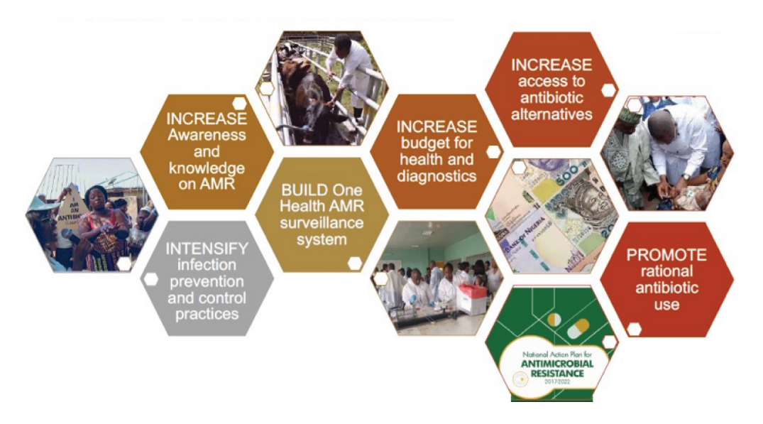
Figure 1. Building blocks to help tackle AMR in Nigeria.