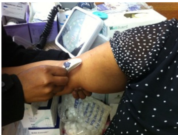
Image 3. A nurse uses Implanon's insertion device to feed the implant into a woman's upper arm.