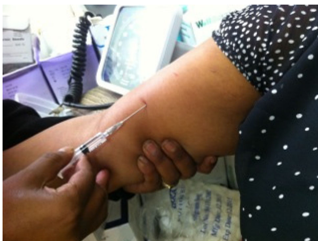
Image 2. A nurse injects a patient with anaesthetic to numb her arm before Implanon insertion.