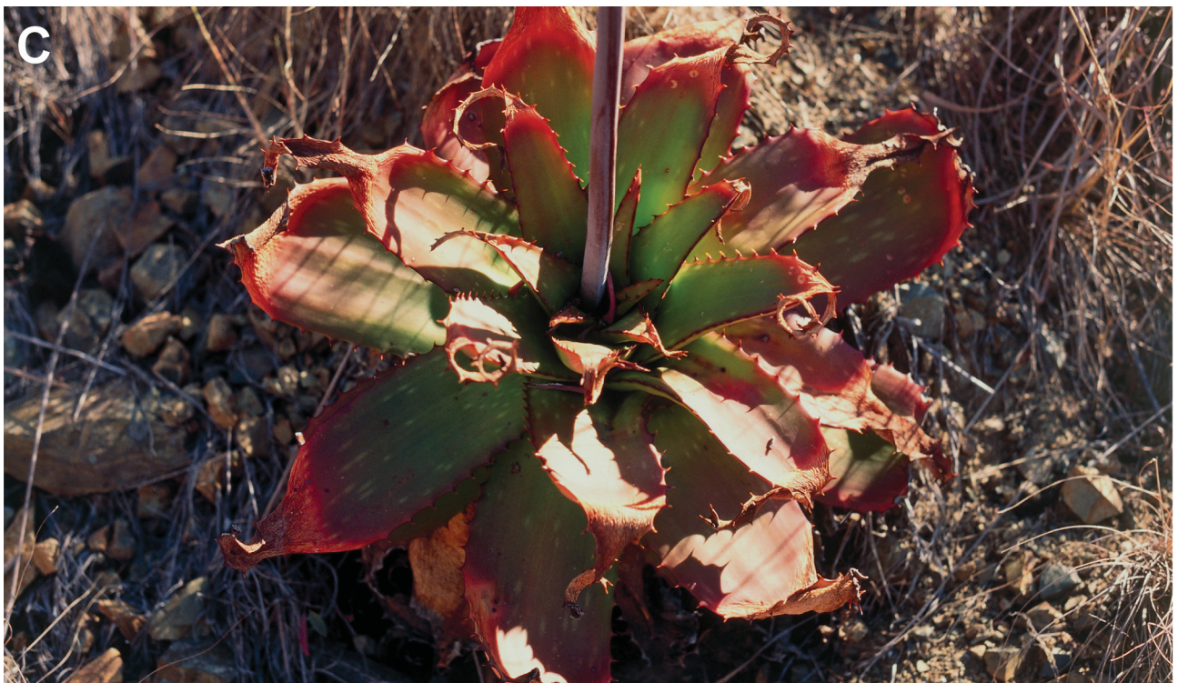
FIGURE 2. Aloe affinis . A. Plant in habitat along Schoemanskloof, Mpumalanga province, South Africa. B. Inflorescences are cylindrical-acuminate, i.e., more cylindrical than in A. immaculata , and round-topped. C. Leaves of the species are generally yellowish green.