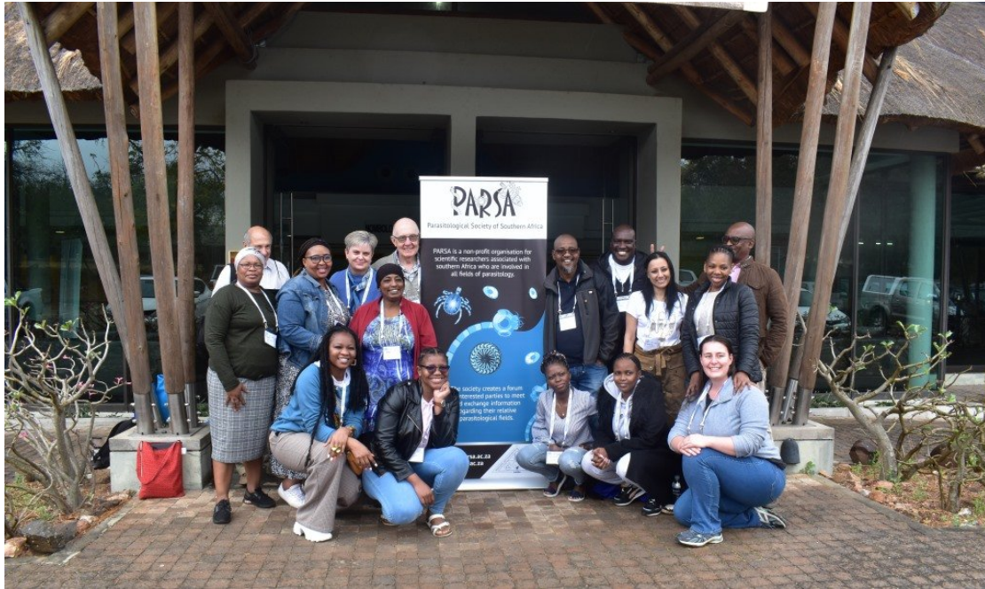
DVTD students, staff and alumni who attended the 50 th PARSA and 4 th ICPOW Conference