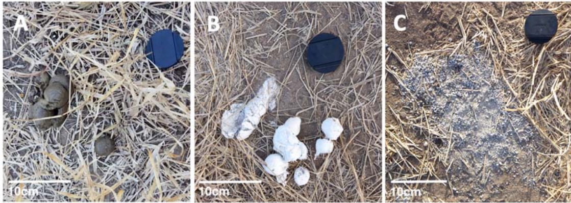
Figure 1. The breakdown of spotted hyaena ( Crocuta crocuta ) faeces from A) brown-green fresh faeces (<12 hrs since defecation), to B) white as it dries (days), and C) after physical breakdown (weeks to months depending on environmental and biotic factors).  in Manyeleti Nature Reserve (MNR) in July 2019.