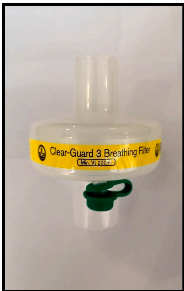
Fig. B3. Clear-Guard 3 Breathing Filter used in this study.