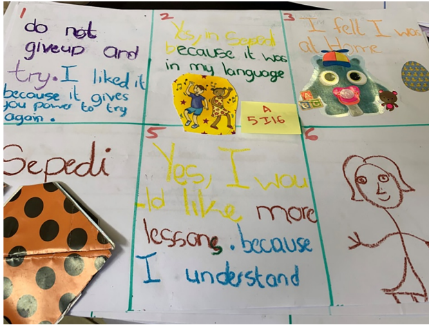
Storyboard 1: Demonstration of attitude.