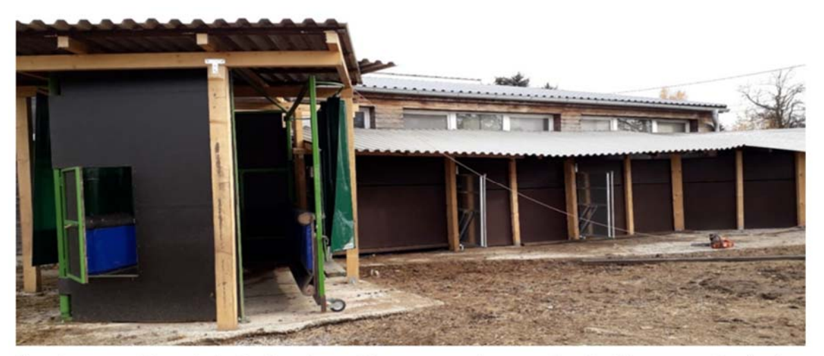
Supplementary Figure 1: A side view picture of the raceway and squeeze chute handling system, showing the galvanized sliding doors, the green plastic curtain and the blue coloured adjustable padded boards on the rotating doors.