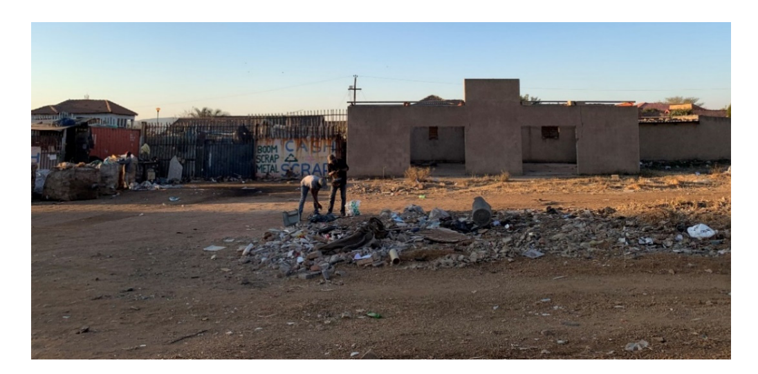
Figure 2. Waste dumped on the side of the street in an informal settlement.

Among a large sample of households living in low-income communities, solid waste was reported by many respondents as being collected on a weekly basis by the municipality, and yet up to 10% of households said they disposed of waste in other ways, such as dumping in the street (Figure 2)/yard, and/or burning or burying waste in the yard. Several reasons for these anomalies may exist despite a formal waste management system existing. For example, other studies suggest that formal waste collection can be erratic in low-income communities and despite weekly collection being mandatory by the government, it does not always occur weekly [4,35]. Reasons for this include a lack of resources or capacity within municipalities and challenges with suppliers [36].