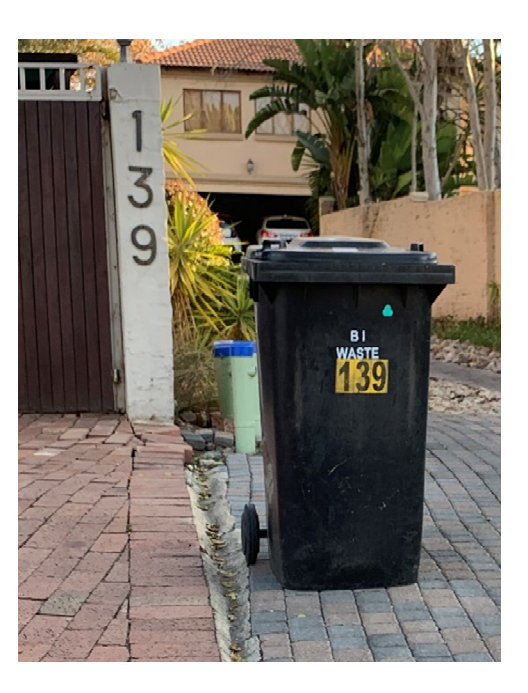
Figure 3. Illustration of a municipal-issued wheelie bin to a formal dwelling.