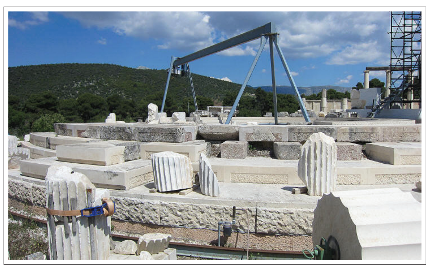
FIGURE 4: Temple of Asclepius at Epidaurus.

ο προσέταξεν Μωϋσῆς, είς μαρτύριον αὐτοῖς (what was commanded/ordered by Moses as a witness to them) points to the status of Jesus as a professional healer. Mary Douglas' view that according to the Levitical code the human body functions as a model of Israel's society particularly as a model for the temple (Douglass 2000:66-86), from an ethnomedical anthropological heightens the characteristics of the professional healthcare system envisioned by Matthew in the healing of the leper in reference to Jesus' meeting all the expectations of healing in Israel's temple particularly as instructed in the Levitical code of purity (Lev 13.34-59). On account of this, we can postulate that just as in the Roman Empire the authenticity of the professional medical health sector was qualified on account of meeting the standards of the Hippocratic tradition, so is the authenticity of Jesus' role as a physician was qualified on account of the leper's healing conforming to standards set out in Levitical code of purity.