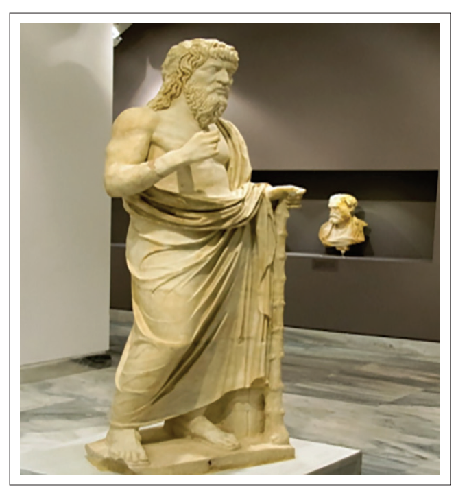
Source: Conybeare, F.C., 2020, Philostratus, Life of Apollonius 3.36–40, viewed 17 August 2021, from https://www.livius.org/sources/content/%20philostratus-life-of-apollonius/philostratus-life-of-apollonius-3.36-40/#3.38

FIGURE 3: Statue of Apollonius of Tyana.