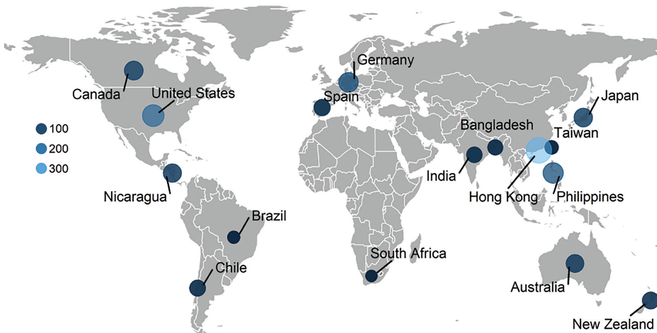
Figure 1. Countries participating in NoroSurv, September 2016–August 2020. Shades of blue and size of circles indicate the number of genetic sequences included from each country.

Throughout the study period, GII.4 Sydney was the most common genotype on all 6 continents and was detected in 52% (687/1,325) of sequences, peaking at 62% (213/343) in 2019–2020 (Figure 2; Appendix Table 1, https://wwwnc.cdc.gov/EID/article/27/5/20-4756-App1.pdf ). The GII.3 (190; 14%), GII.2 (149; 11%), and GII.6 (64; 5%) genotypes comprised 30% of sequences (Figure 2; Appendix Table 1). GI.3 was the most frequently detected GI genotype, accounting for 55% (50/91) of all GI viruses and 4% of all NoroSurv sequences. The remaining 14% (185/1,325) of sequences were composed of 17 other genotypes: GI.1, GI.2, GI.4, GI.5, GI.6, GI.7, GI.9, GII.1, GII.4 Hong Kong, GII.4 untypable, GII.7, GII.8, GII.12, GII.13, GII.14, GII.17, and GII.20 (Appendix Table 1). We detected 687 GII.4 Sydney viruses associated with 3 P-types: P16 (399; 58%), P31 (280; 41%), and P4 (8; 1%). The proportions of each genotype varied by year (Figure 2; Appendix Table 1) and country (Appendix Tables 2–17). The most