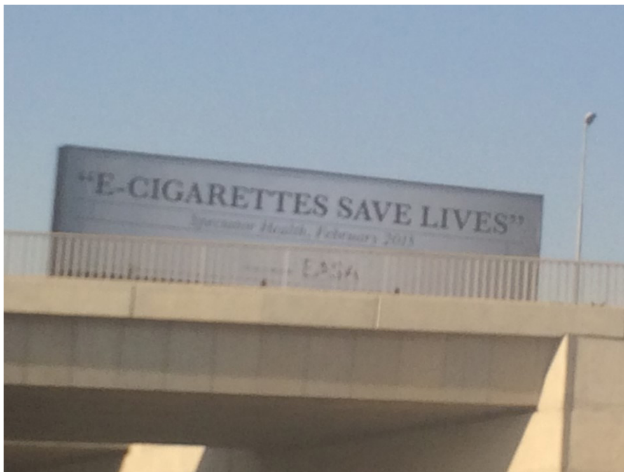
Figure 1 Advertising of e-cigarette with health claims over a billboard in South Africa during 2015

manufacturers in the country to remove certain advertisements that made health claims and glorified vaping. 12 This agreement with ASA, while welcome, is only a ‘band-aid’ solution because it is narrow in scope and authority; other advertising companies who are not members of this professional union (ie, ASA) are not bound to those agreements and can still engage in such advertising as it is not illegal to do so until a law is passed