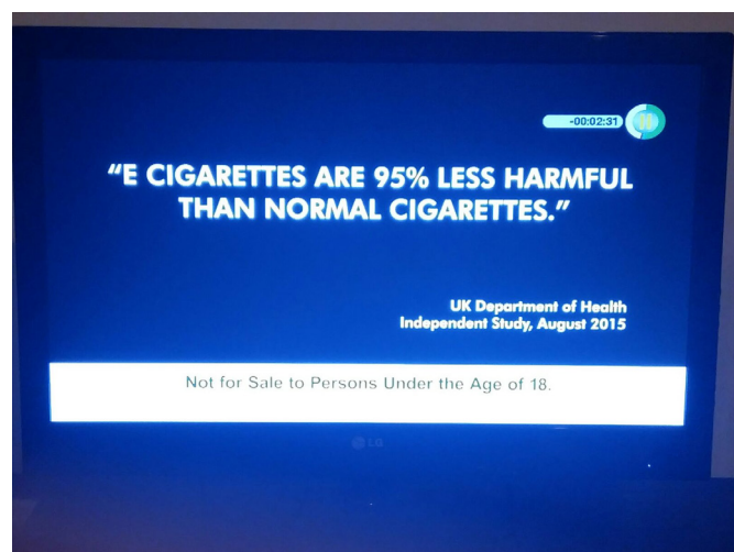
Figure 2 E-Cigarette health claim being shown on television in South Africa during 2016.

manufacturers in the country to remove certain advertisements that made health claims and glorified vaping. 12 This agreement with ASA, while welcome, is only a ‘band-aid’ solution because it is narrow in scope and authority; other advertising companies who are not members of this professional union (ie, ASA) are not bound to those agreements and can still engage in such advertising as it is not illegal to do so until a law is passed